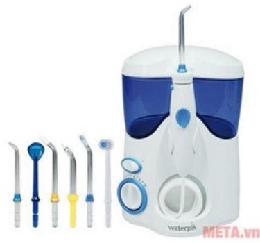
Máy tăm nước có dây