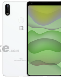
Trắng pha lê