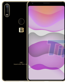
Đen huyền bí