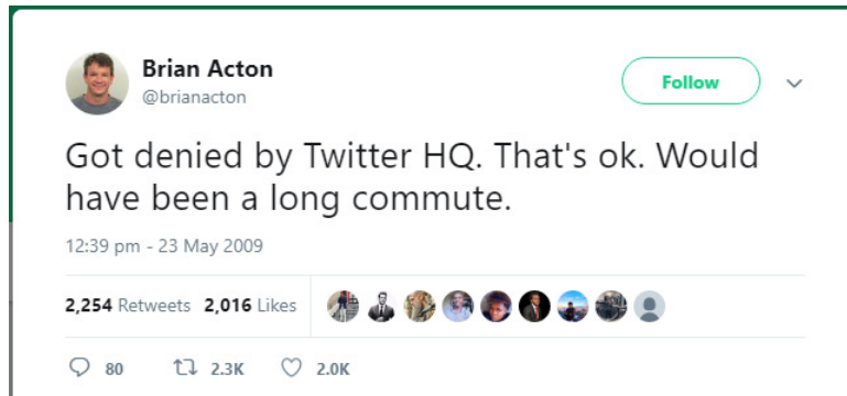
Tweet of Brian Acton when he slipped an interview at Twitter written in May 2009.