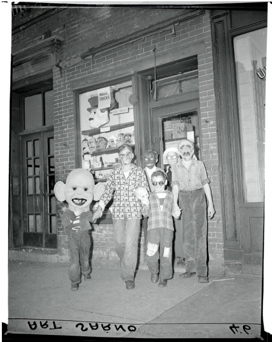
Children go to Halloween with a weird mask in New York City in 1949.