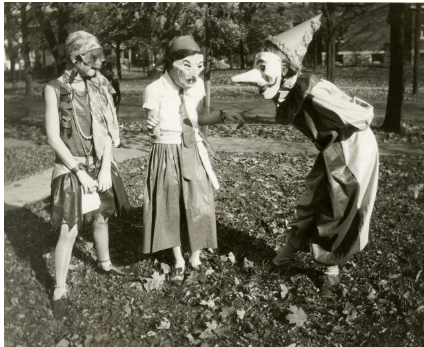
Three girls with macabre mask costumes in Cincinnati, Ohio, USA in 1929.