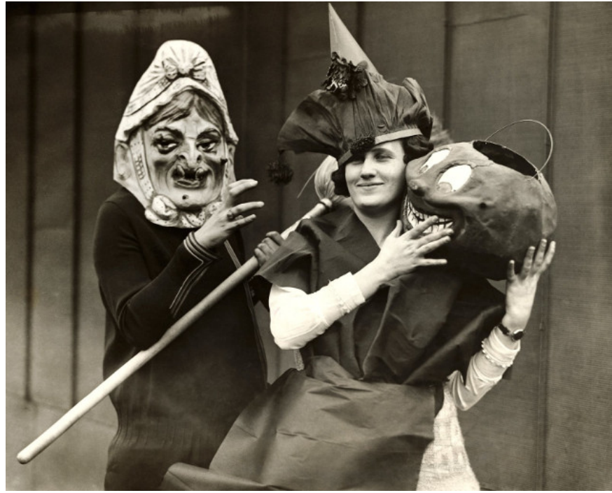
The witch and the girl go to the Halloween festival in 1923.