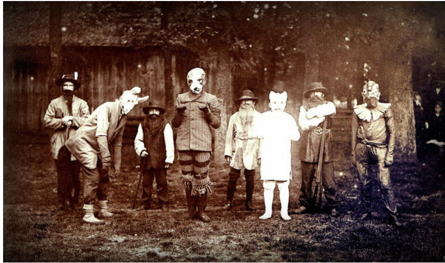
If you go with many people you can disguise as animals. A photo of an animal mask photographed in 1911.