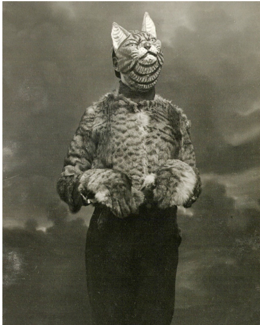
The man with the costume transformed into a cat in France in 1920.