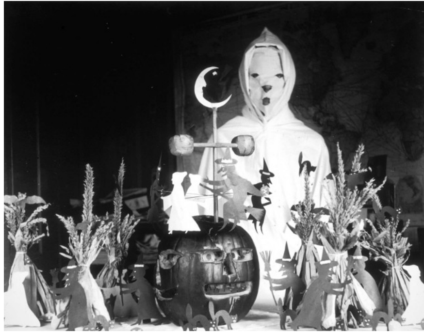
Dressed with a white outfit, sitting next to the Halloween altar will be an image that will frighten many people. This photo was taken in 1905.