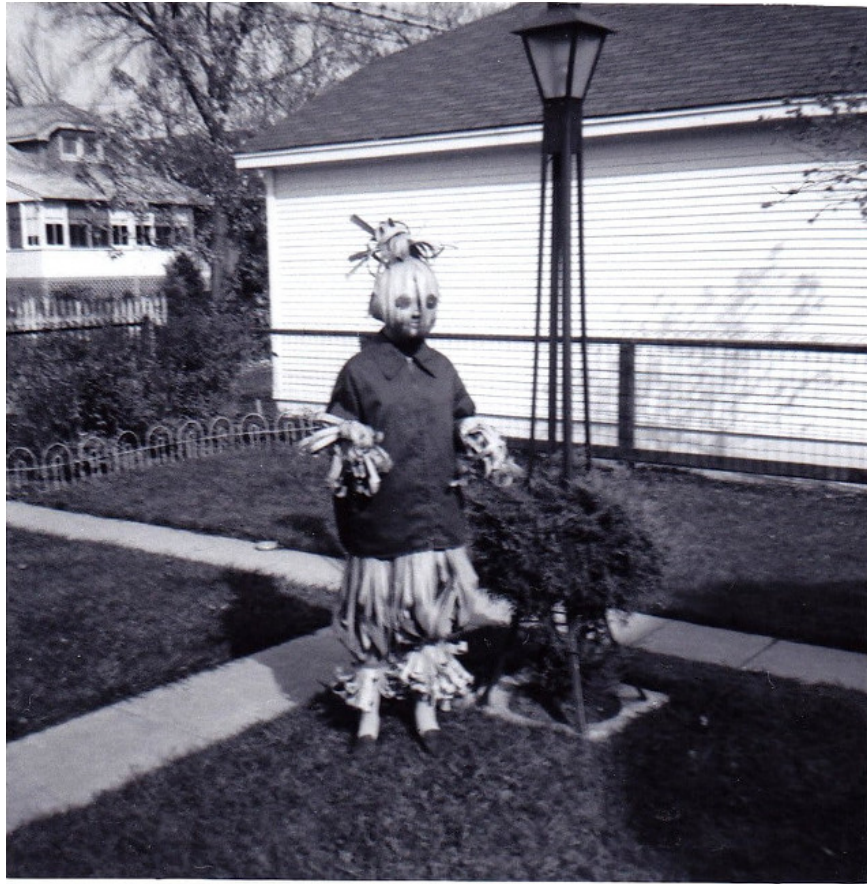
The boy in straw overalls, photo taken in 1965.