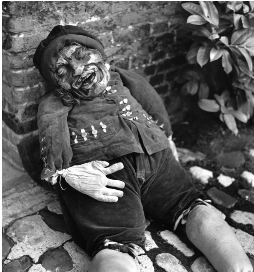
A doll lay grinning on the front porch, in 1900.