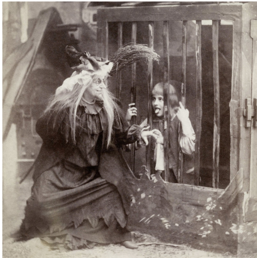
Woman and child wearing witch costumes and Hansel - famous fairy character, in 1894.