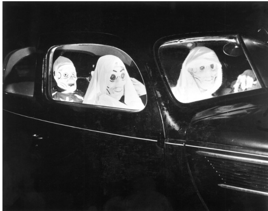
Clothing is simple like that but it also makes people watch chicken skin. Photo taken in 1938.