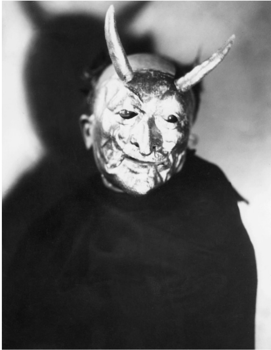
A devil mask and black cloak will make you very impressed. This is the evil costume of a German man in 1928.