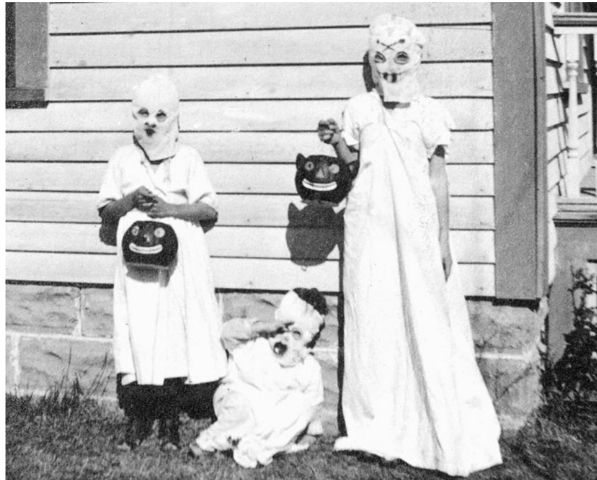
Three children dressed as ghosts for candy, this picture was taken in 1925.

In the Halloween festival season this year, if you have not had any idea to disguise yourself to be impressive and scary, you can consult some suggestions Halloween costumes dozens of years ago. Surely it will make you a real devil for Halloween.