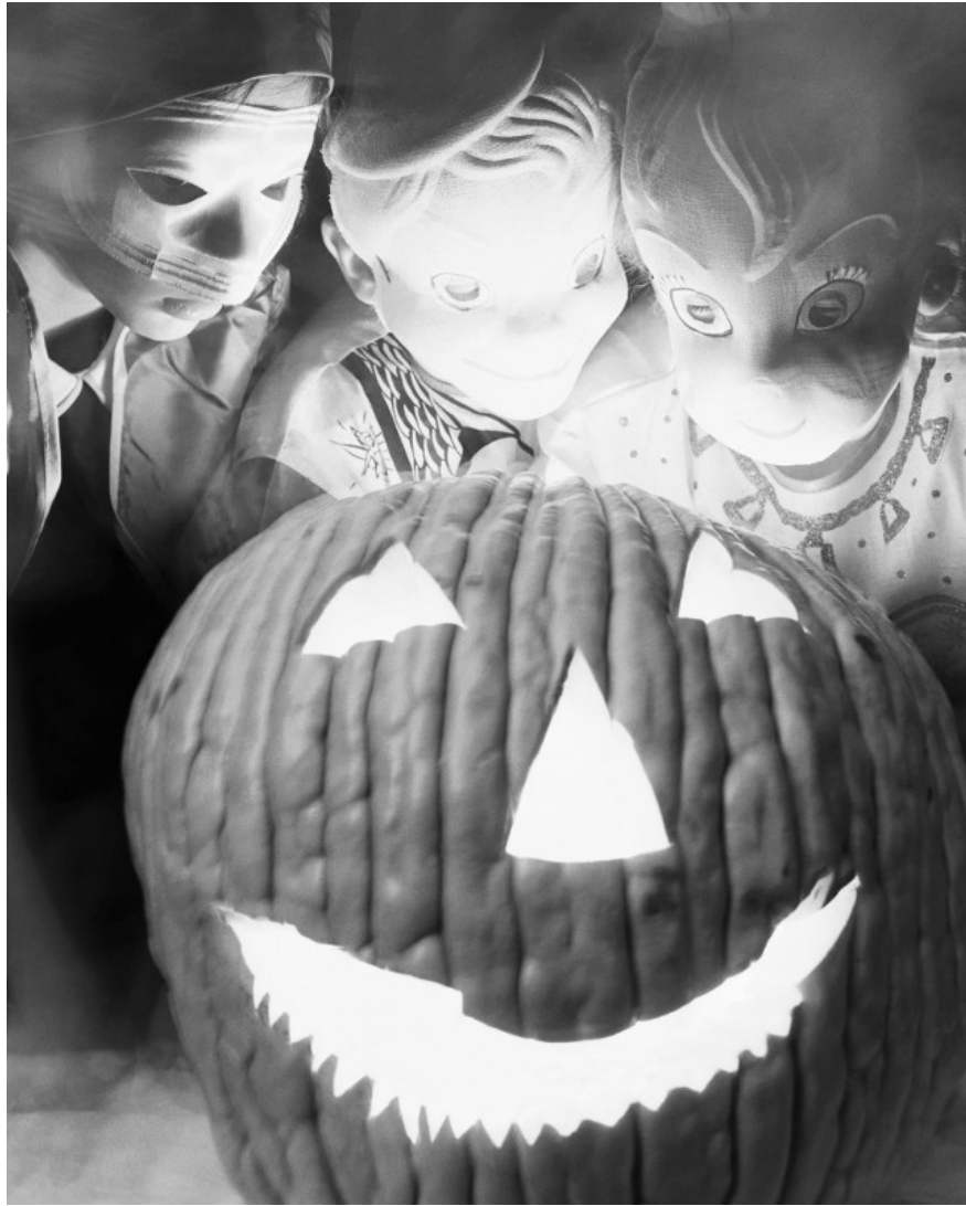
Masked children and pumpkin lanterns roamed the neighborhood, the picture was taken in 1954.