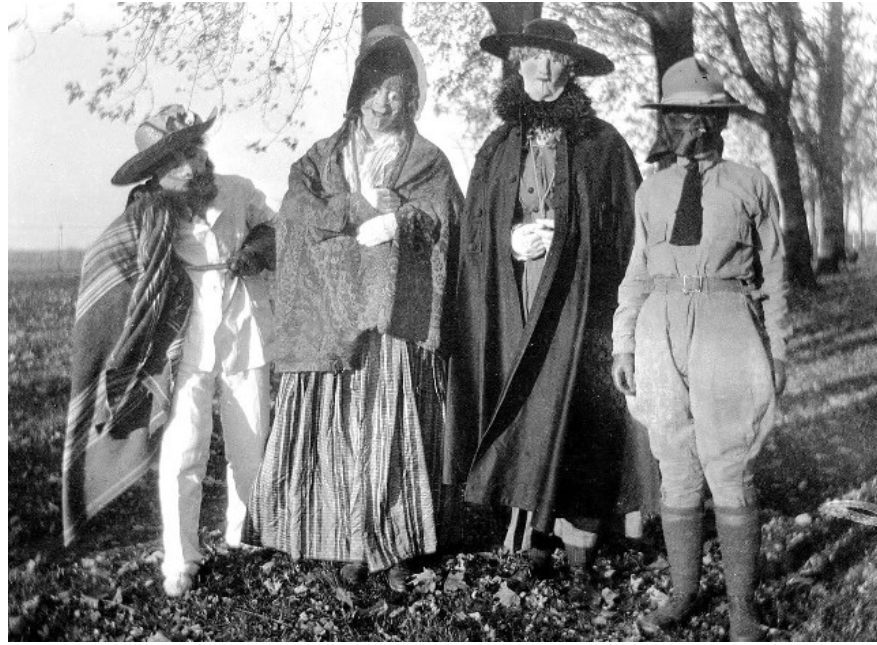
A group of people dressed in costumes, photos taken in 1920.