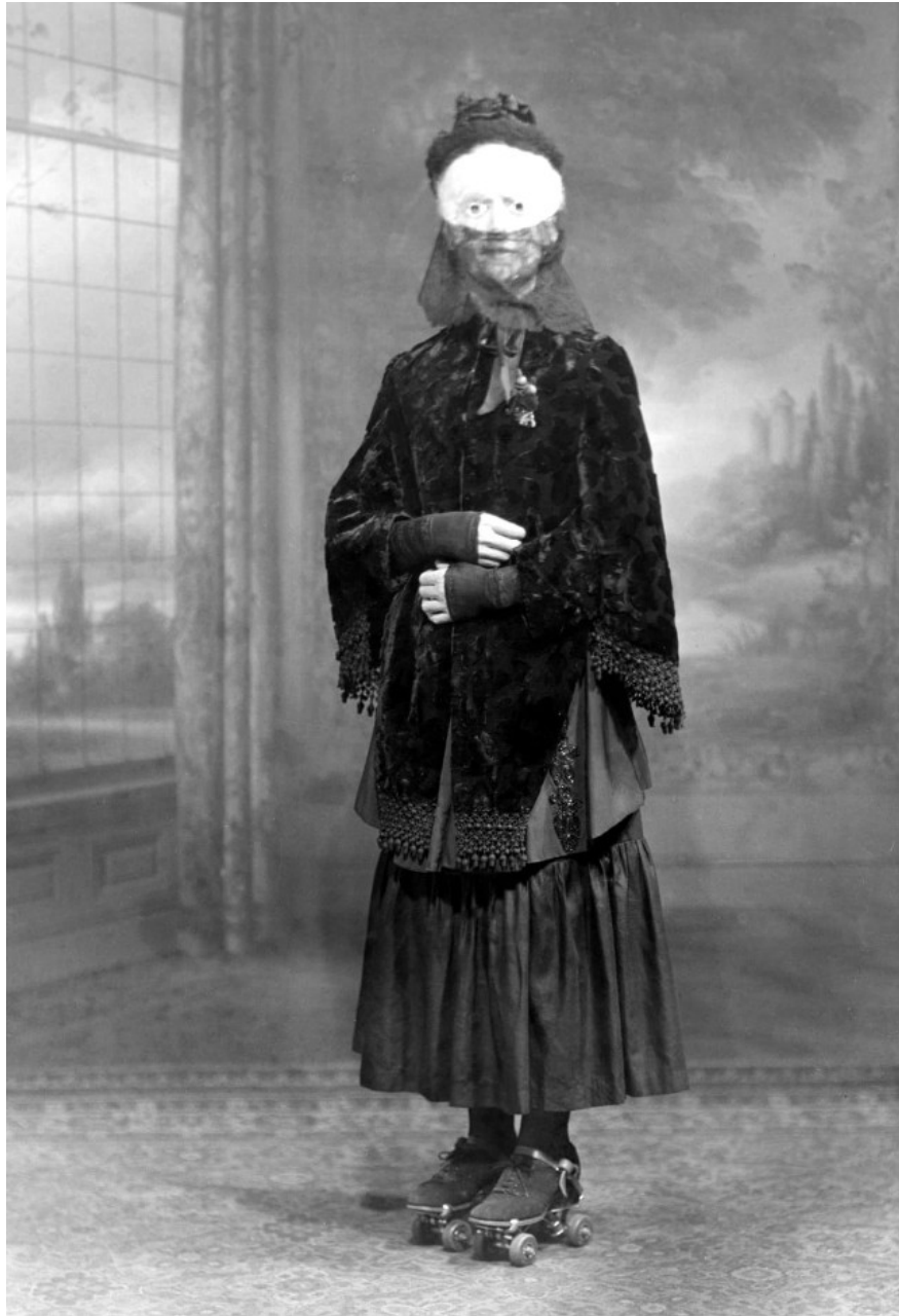
A woman wearing a mask, she looked mysterious. The photo was taken in 1910.