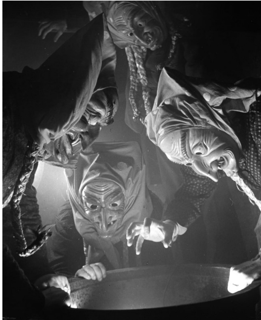
Witch mask, photo taken in 1939. Witches work together to create monks.