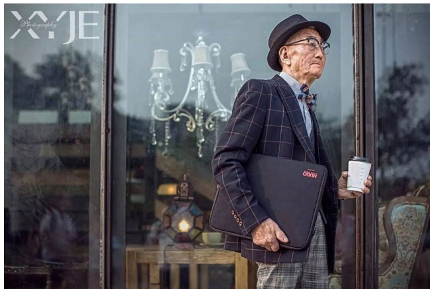
He looked like a successful person