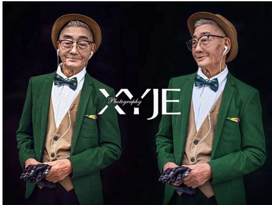
Younger with gloves and headphones