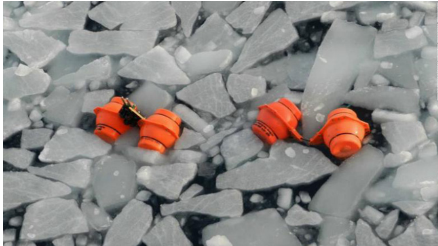
The device used to measure sea temperature

The decline in the mass of the ice sheets in Greenland is the only cause for accelerating global sea level rise. According to another report published in December in Nature, the ice sheets in Greenland are thawing seven times faster than in 1992.