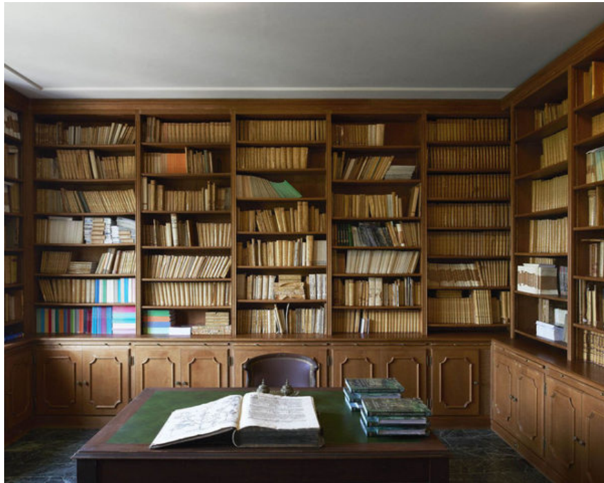
Library room with 3,000 books.