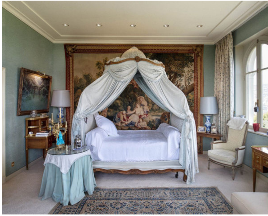
A bedroom upstairs.