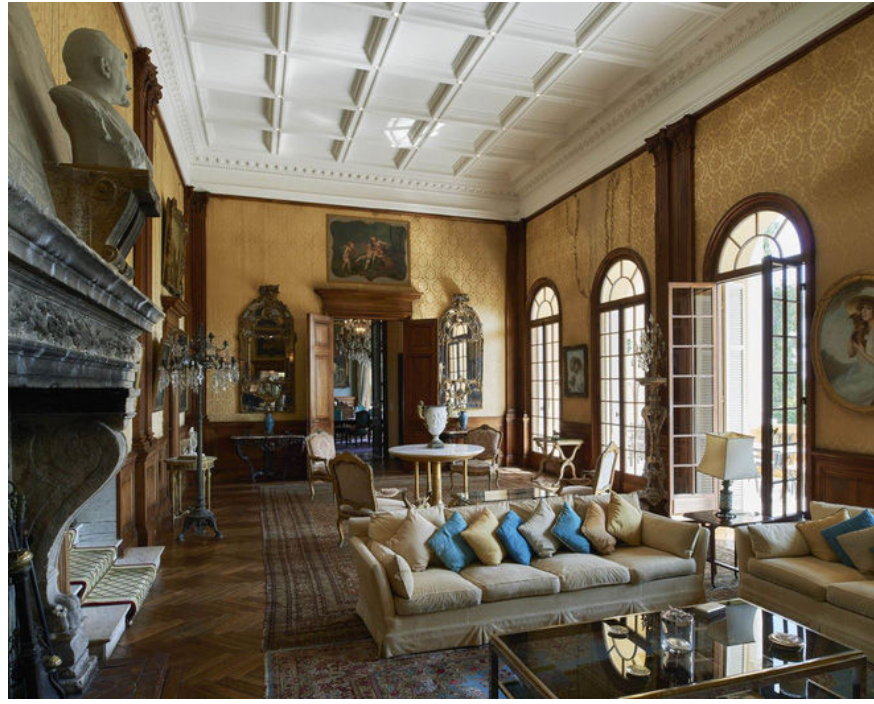
A living room on the ground floor with silk-covered walls.