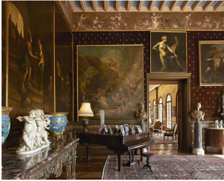
A living room with many pictures of 19th century style.