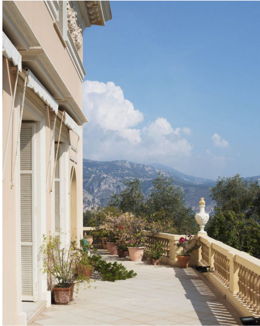
From the balcony you can see the Alps.