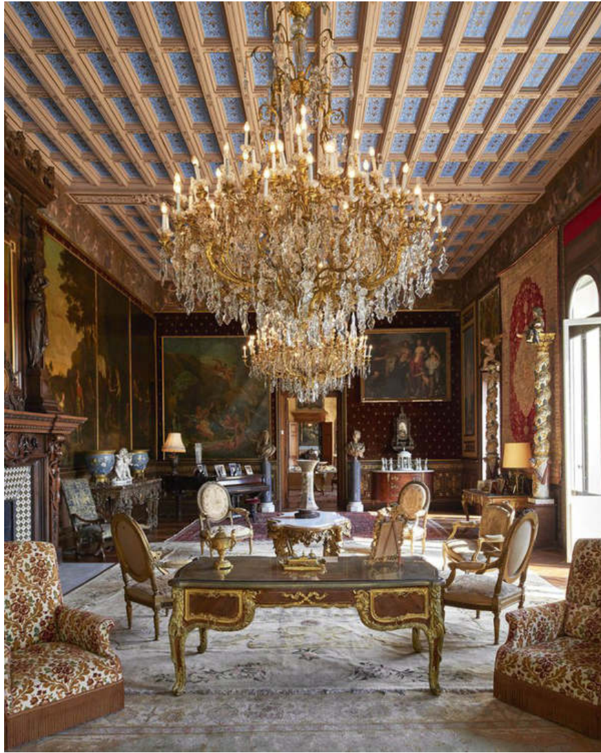
Another living room at Villa Les Cèdres features a French-style antique chandelier.