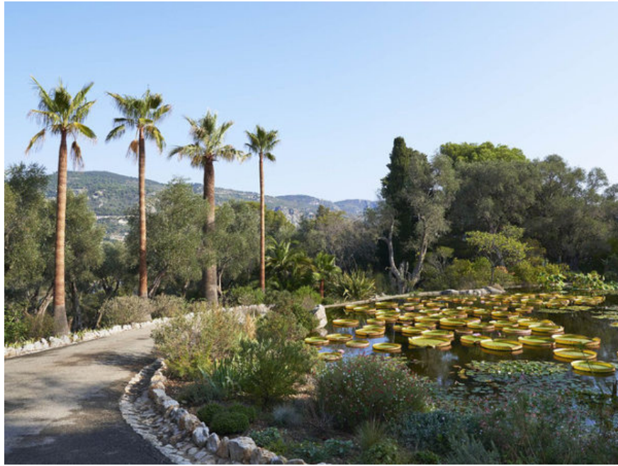
Large artificial pond of the villa.