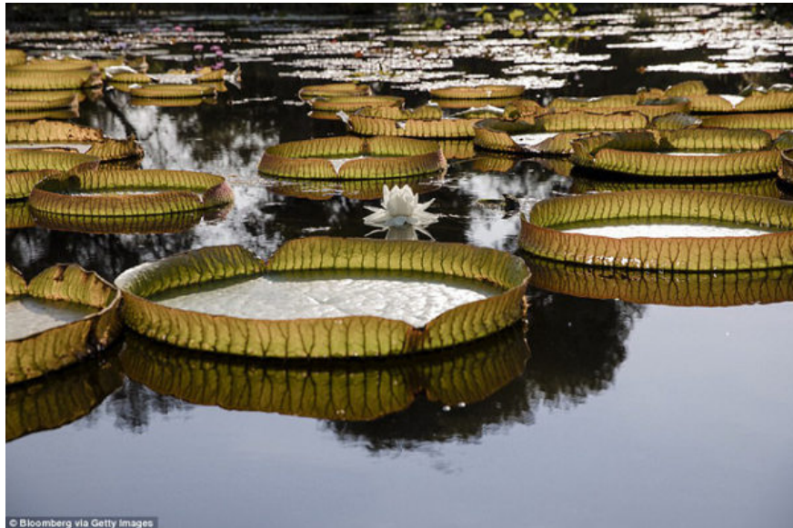
Amazon lily carpet.

You finished reading the article " Villa Les Cèdres, the most expensive villa in history has nothing special " edited by the TipsMake team. We hope this article has provided you with many useful tech tips and tricks. You can search for similar articles on tips and guides. Thank you for reading and for following us regularly.