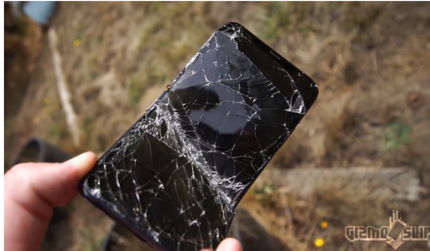
iPhone Xs Max after being slashed with Japanese swords.