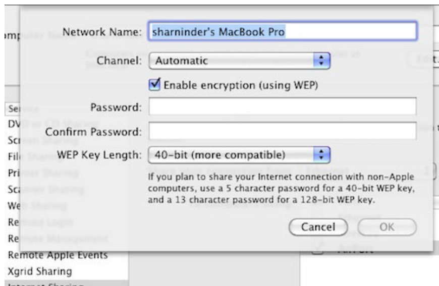
Figure 2: Create Adhoc Network.

Click on Airport Options as shown in Figure 1, then we will see a message showing asking for a new network name (Figure 2).