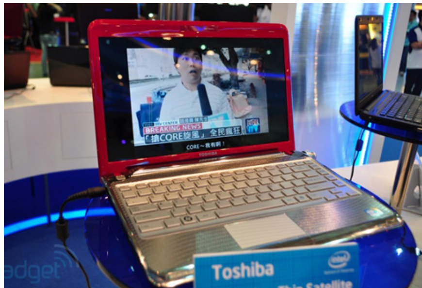
Small Satellite M135 with 13 inch screen size.

The Satellite M135 model introduced by Toshiba at Computex 2010 is equipped with a chic and luxurious chiclet keyboard instead of the typical Toshiba keyboard. It owns a 13-inch screen, Intel Core i5-U520 processor and also has the option of using AMD's Athlon Neo II processor.