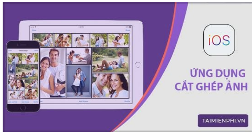
Photo editing app for iPhone and iPad.

On its iPhone and iPad products, Apple provides users with photo editing tools, but only for basic features. For more advanced editing that truly reflects your preferences, you'll need to use third-party photo editing apps for iPhone and iPad .