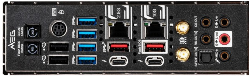
Connection port on the GODLIKE product