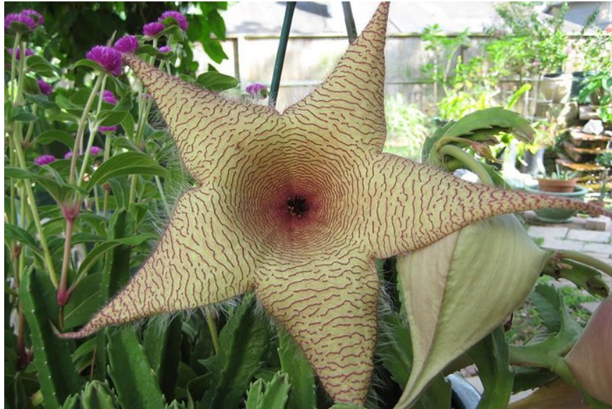
Stapelia gigantea is a beautiful flower that smells like rotten meat. They are found in tropical Southeast Africa