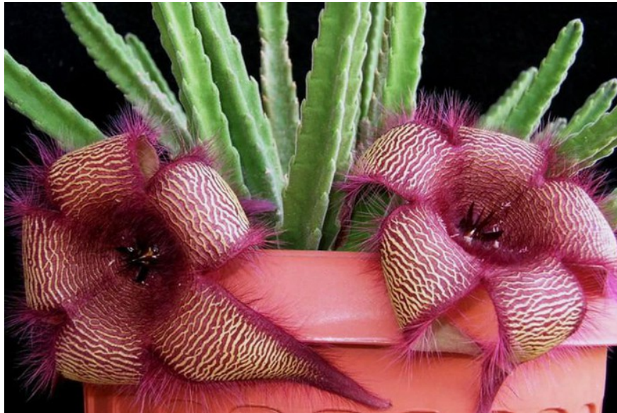
This flower is impressed by its starfish-like appearance. Stapelia gigantea blooms in the summer. Their special shape and smell like rotten meat help them attract pollinators