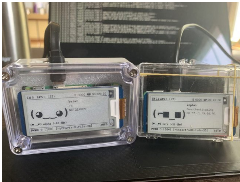
Pwnagotchi, wifi hacking device with cute smiley face.

The software for Pwnagotchi, now publicly available on September 19, allows hackers to use it, and it can edit and add plugins to it.