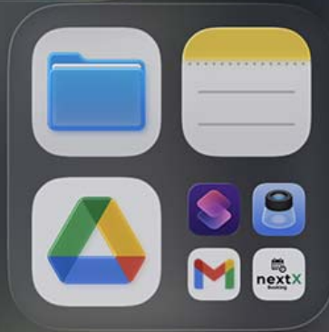
Hiệu suất & Tài chính