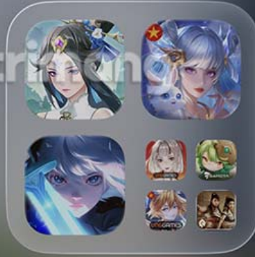
Đã thêm gần đây