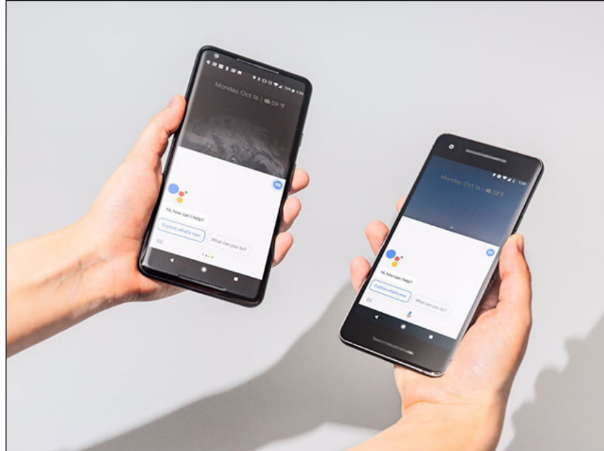
These are Google's Pixel 2 and Pixel 2 XL phones

Not to say much, this is the first advantage of all phones compared to the iPhone X, including Pixel 2 and Pixel 2 XL, with prices of $ 1000, $ 650 and $ 850, respectively.