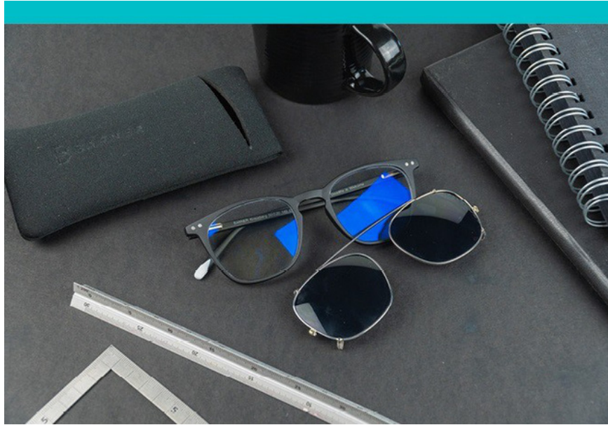
Barner 2.0 with square glasses .