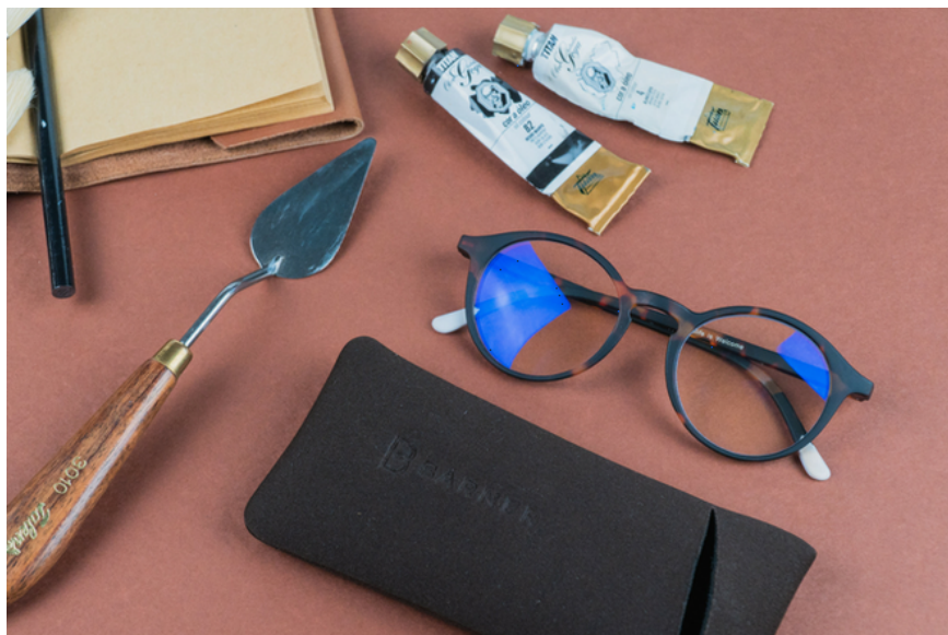
. and this is the round form.

Version 2.0 is different from the previous generation in that the frames are now more flexible, cheaper materials but still good enough, increase grip on the bridge of the nose and fit snugly with many head sizes. In addition to the current 4 colors are black, pink, army green and 'turtle shell' with black / brown spots covering the rim. Barner will unlock new color versions when reaching the full stretch goal within the call period.