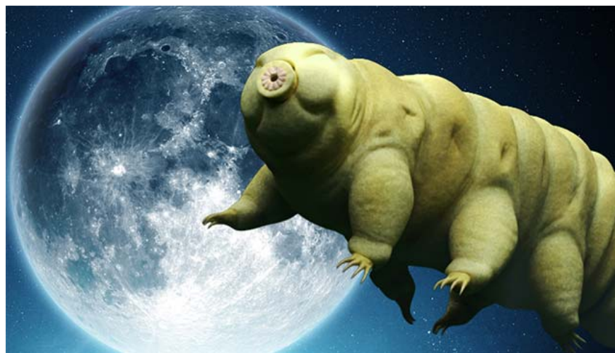
Water bears on the moon will eventually perish

However, basically, any form of life that wants to exist requires water and nutrients, even if at a minimum, water bears are no exception. They mainly take oxygen and food from water. On Earth, water bears often live on the