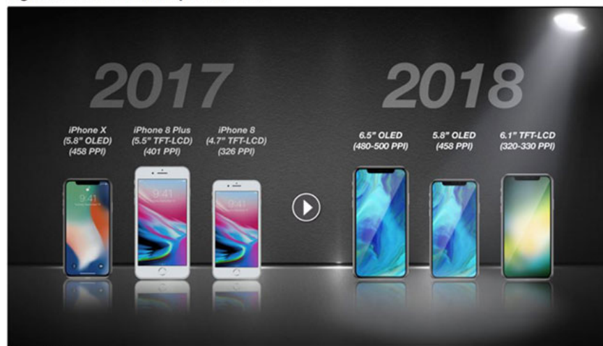
Figure 1: 2018F iPhone product mix

Apple has brought a completely new design to the iPhone in 2017. iPhone X has no Home button, uses face detection technology and the screen is almost overflowed.