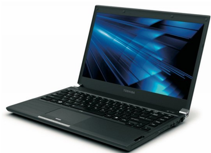
Portégé R700 features a 13.3-inch screen.