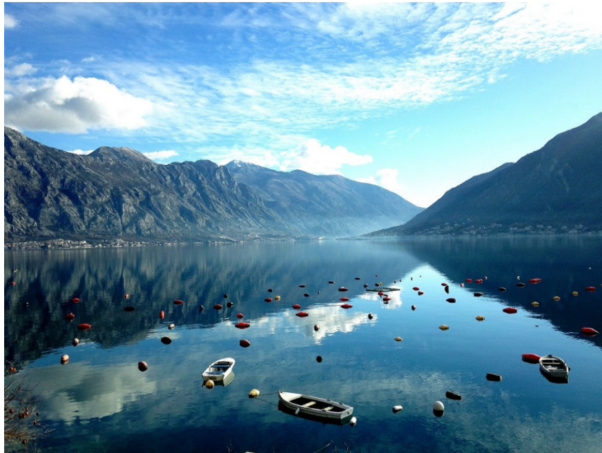
Beautiful pearl farm near Perast town.