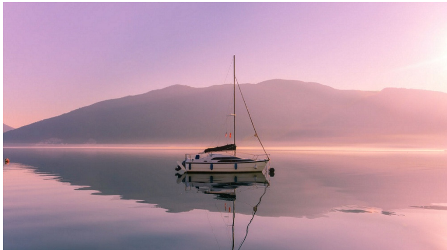
Dawn on Kotor bay.(Photo: Liza Dolz).

The landscape in Montenegro really looks like a beautiful picture that combines the most beautiful regions in the world. Almost all of the great scenery of the Earth, from picturesque tranquil mountain lakes, snow-capped peaks, blue Adriatic sea, to majestic waterfalls, rivers in the green hidden in the primeval forests and imposing canyons, the small coastal towns are peaceful and peaceful . all "reunite" here.