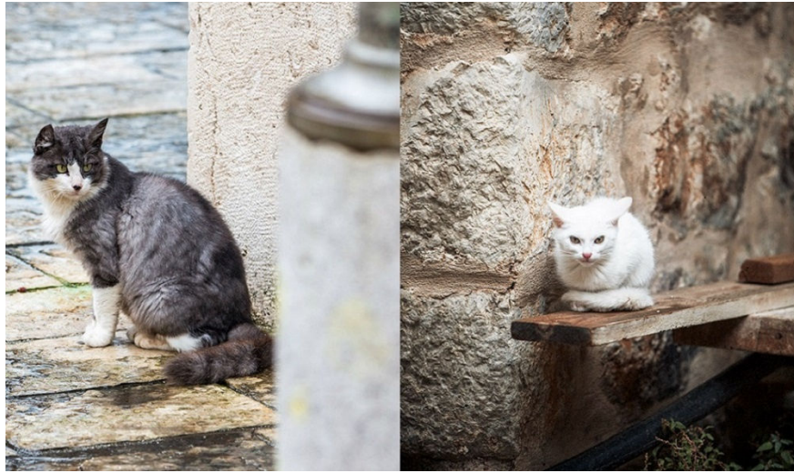
Live cats roam the streets loved and cared for by Montenegrin people.