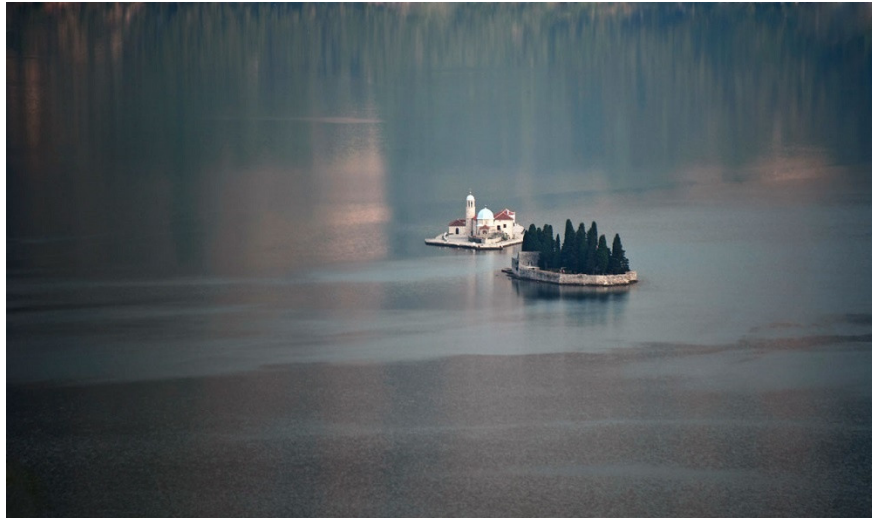
The island of Gospa od Skrpjela and St George monastic island is located in the center of Kotor Bay.(Photo: Ilija Khodos).