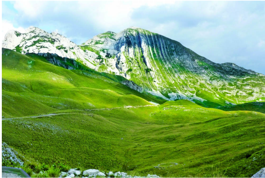
Durmitor National Park.(Photo: thebalkanbackpacker).