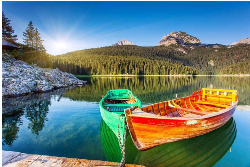
Dawn on the Black Lake (Crno jezero).