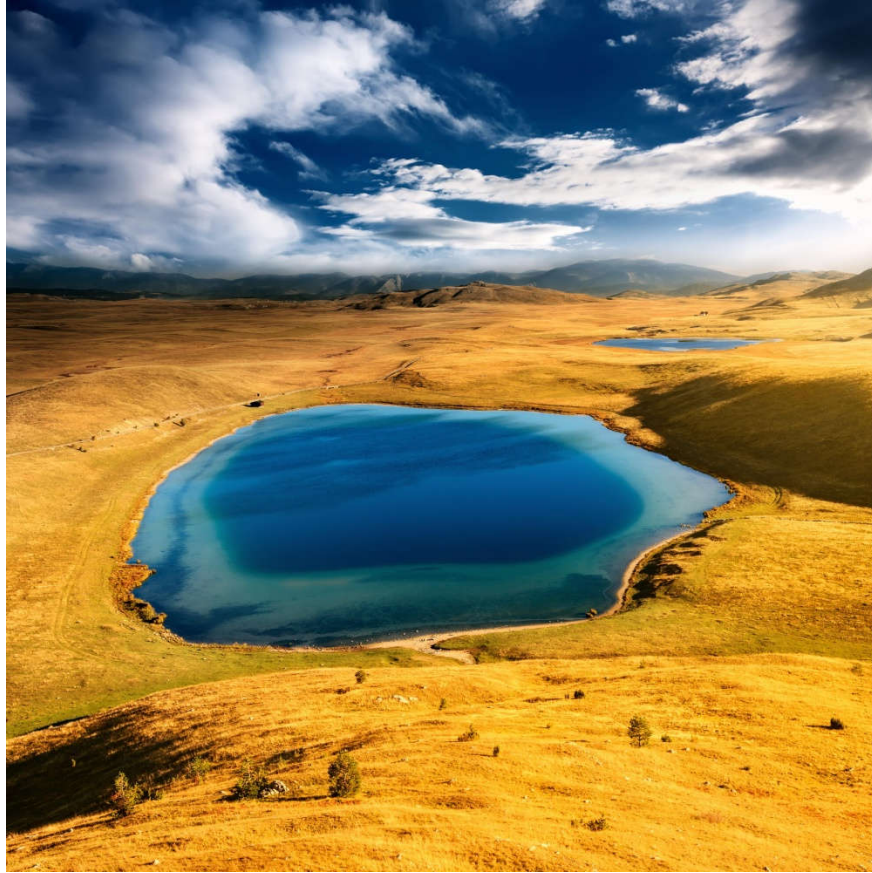
Vražje Jezero, with its unique beauty, belongs to another planet.(Photo: Yiannis Adamopoulos).