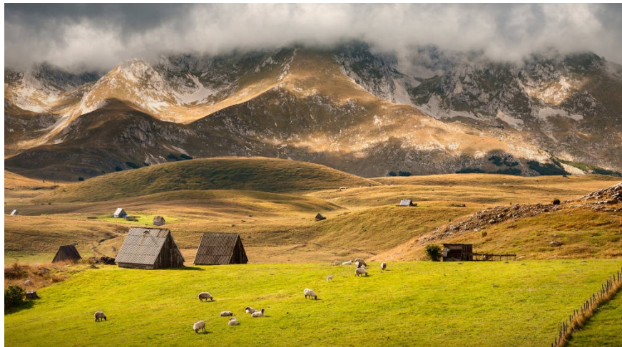
An ancient village in the north lurks among the mountains, which are covered with white clouds on top, creating an extremely peaceful setting.