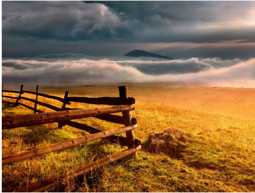
The wilderness of northern Montenegro is poetic.