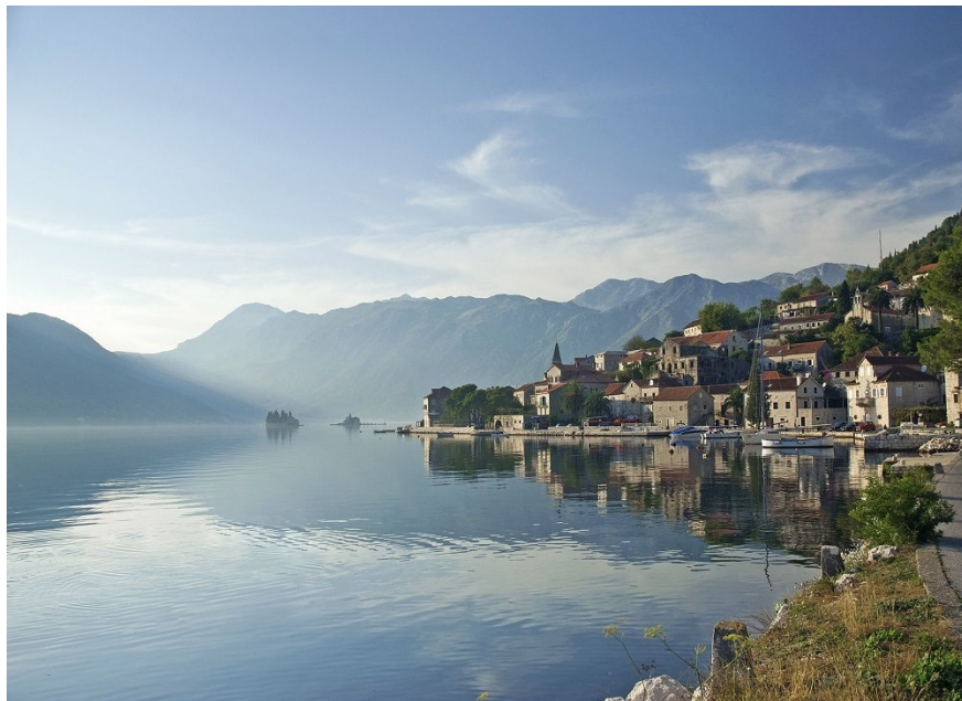
A peaceful harbor in Perast town.(Photo: Jackmalipan).