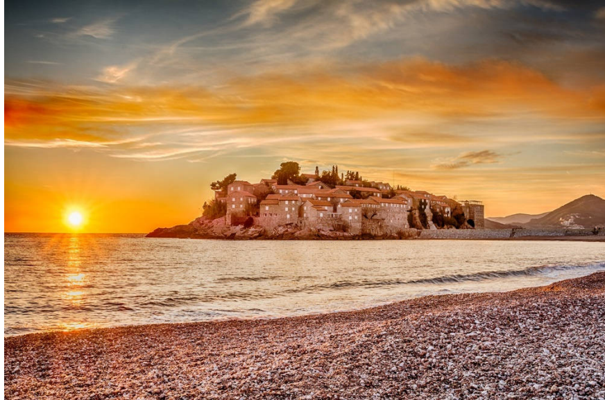
Hotel on the island of Sveti Stefan on the Adriatic coast.