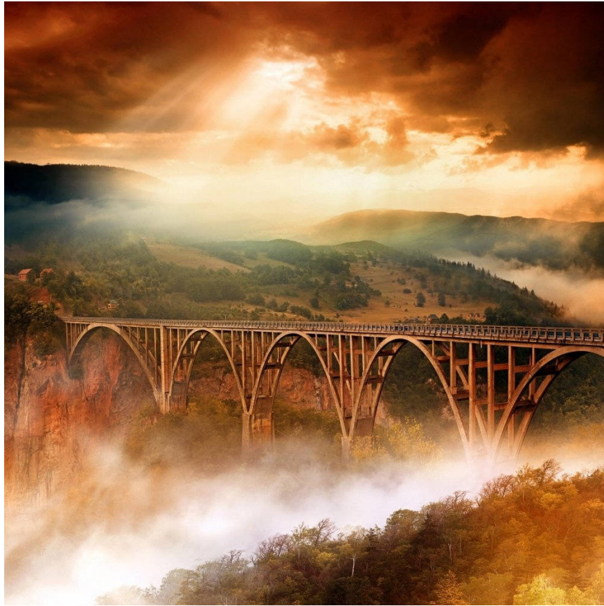
The Dzhurdzhevicha Tara Bridge is 172m high, passing through the canyon where the Tara River flows.