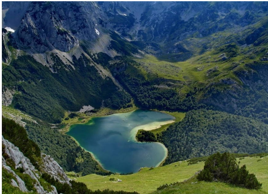
Lake Trnova?ko bears a heart shape located at an altitude of 1517m above sea level surrounded by deep green forest..

You finished reading the article " The whole Earth seems to shrink in this beautiful country " edited by the TipsMake team. We hope this article has provided you with many useful tech tips and tricks. You can search for