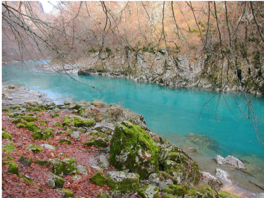
Tara River winds around the picturesque canyon.