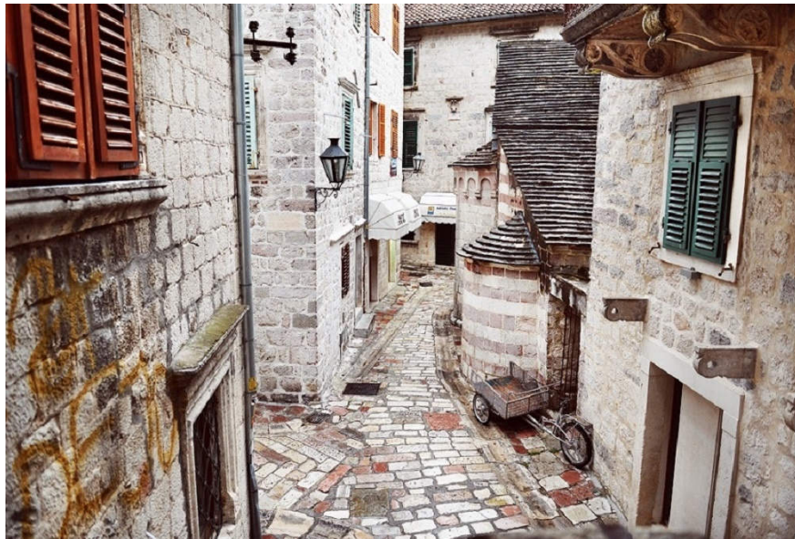
A corner of the street maze of the coastal town of Kotor, one of the medieval towns recognized by UNESCO as a world heritage site..