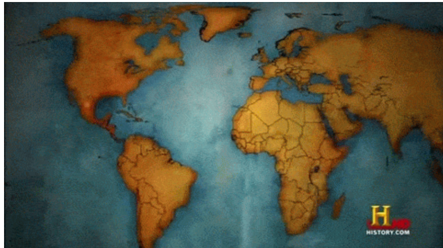
Images of "Silent Zone", Bermuda's "demon triangle" and Egyptian pyramids are on two parallel lines on Earth's coordinates.

" Silence zone " an area where sound waves cannot penetrate. Bermuda's " demon triangle " region in the western Atlantic Ocean is the "grave" of boats and airplanes when it comes here. The world's oldest hundred-ton monolithic building series (Egyptian pyramids) are closely linked.