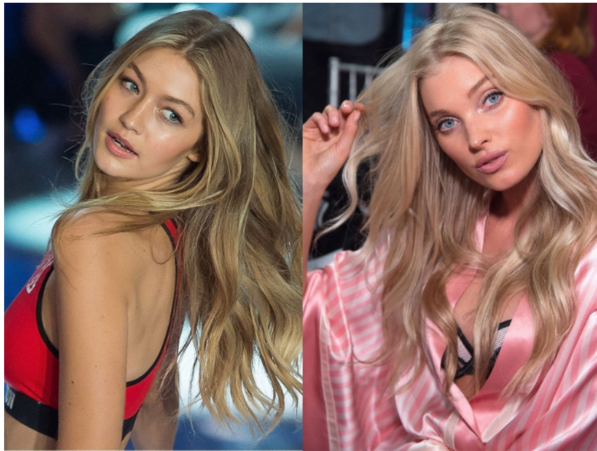
Cool highlighter, smoky eyes and pink nude lipstick are the beauty keywords of Victoria's Secret long legs in the 2015 show.