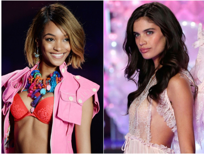
VSFS 2014 with minimalistic makeup formula emphasizes the healthy shadow of the skin.