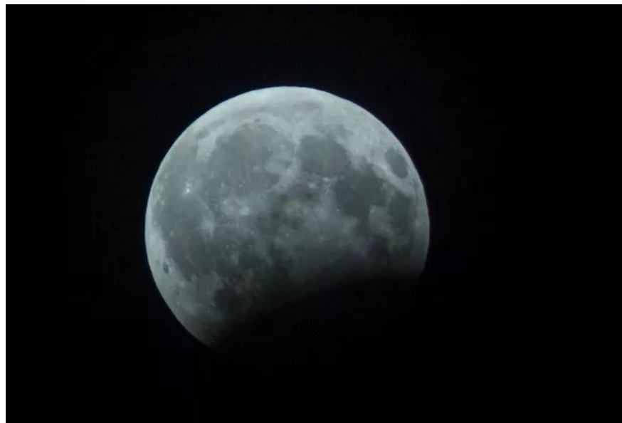
Arrive at 1:22.