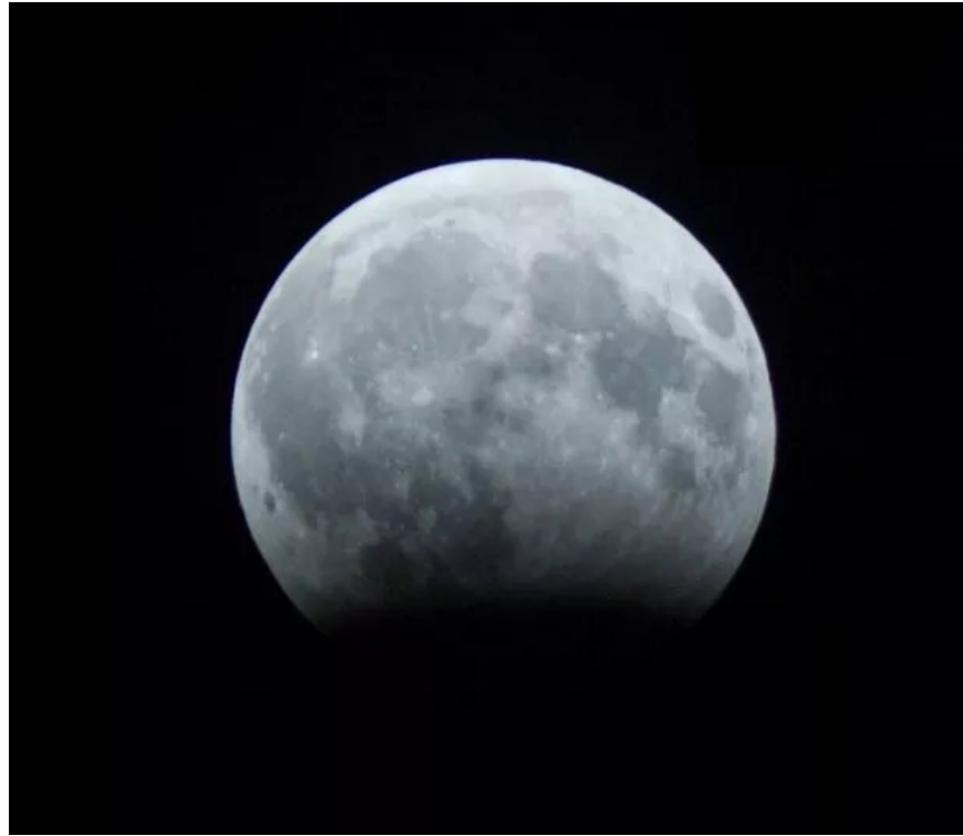
Moon at 0:00 53 minutes today in Hanoi.