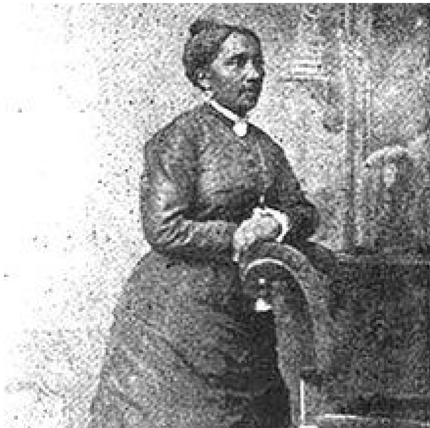
Elizabeth Jennings Graham, a black activist, daughter of Thomas Jennings.

At the same time, Thomas was one of the founders of the Legal Rights Association, a group that organizes challenges to discrimination and discrimination and has a legal representative to bring lawsuits out. court. Jennings died in 1856, only a few years before the custom he had fought - the slave - was abolished.