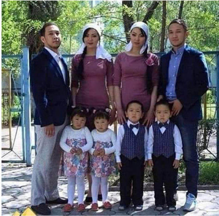
Her mother's eyes are inherited to her two daughters.