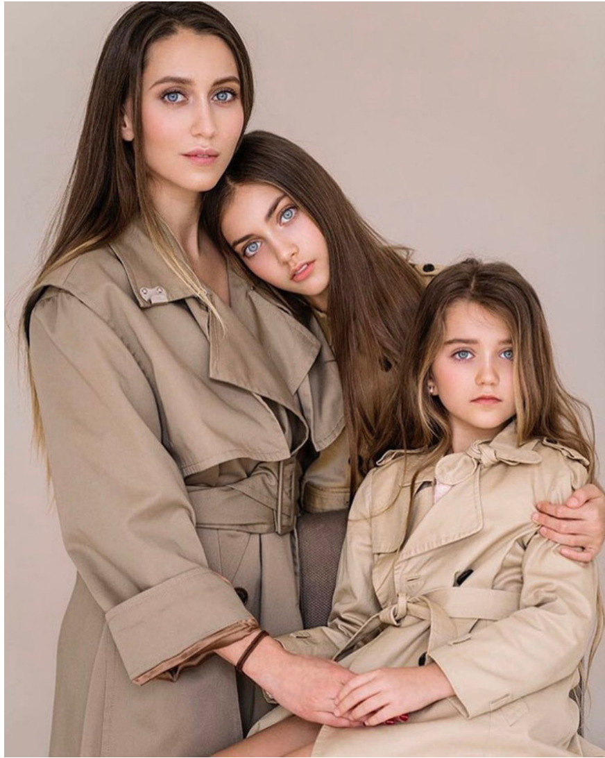
A family has 3 twin generations, this can only be decided by genes.