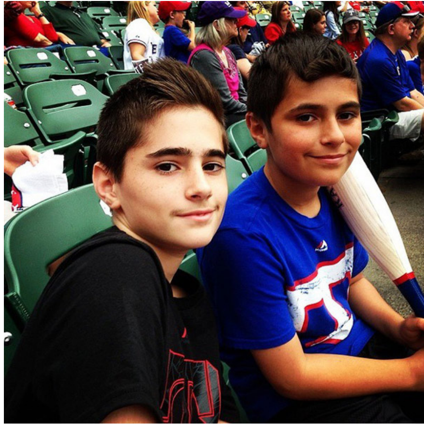
Son (right photo) and. his mother was a child.