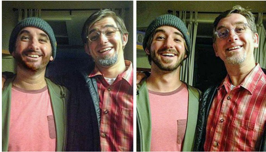
Two photos taken 30 years apart: The boy in the picture above is the father in the picture below.