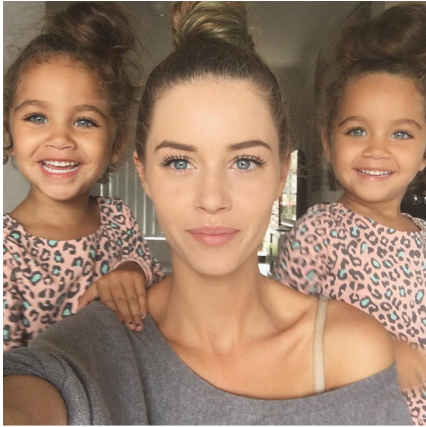
Two sisters were born 18 months apart, but everyone thought they were twins.