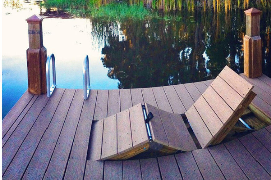
Integrated bench right on the jetty.