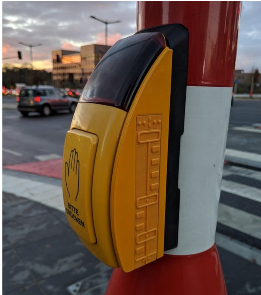
This system of buttons is pre-printed with a embossed pattern so that the blind can know what obstacles to avoid.