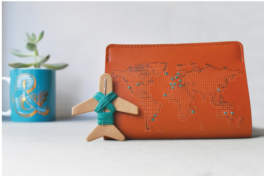
Passport covers with a map of the world, wherever you go, mark them.