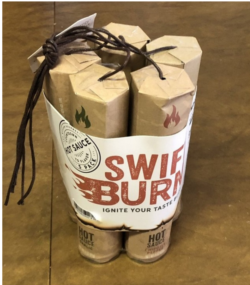
Combo of 5 bottles of chili sauce packed like mines, look how spicy it is.

Looking at these product designs does not mean directing a fictional film director to have the imagination of flying high.