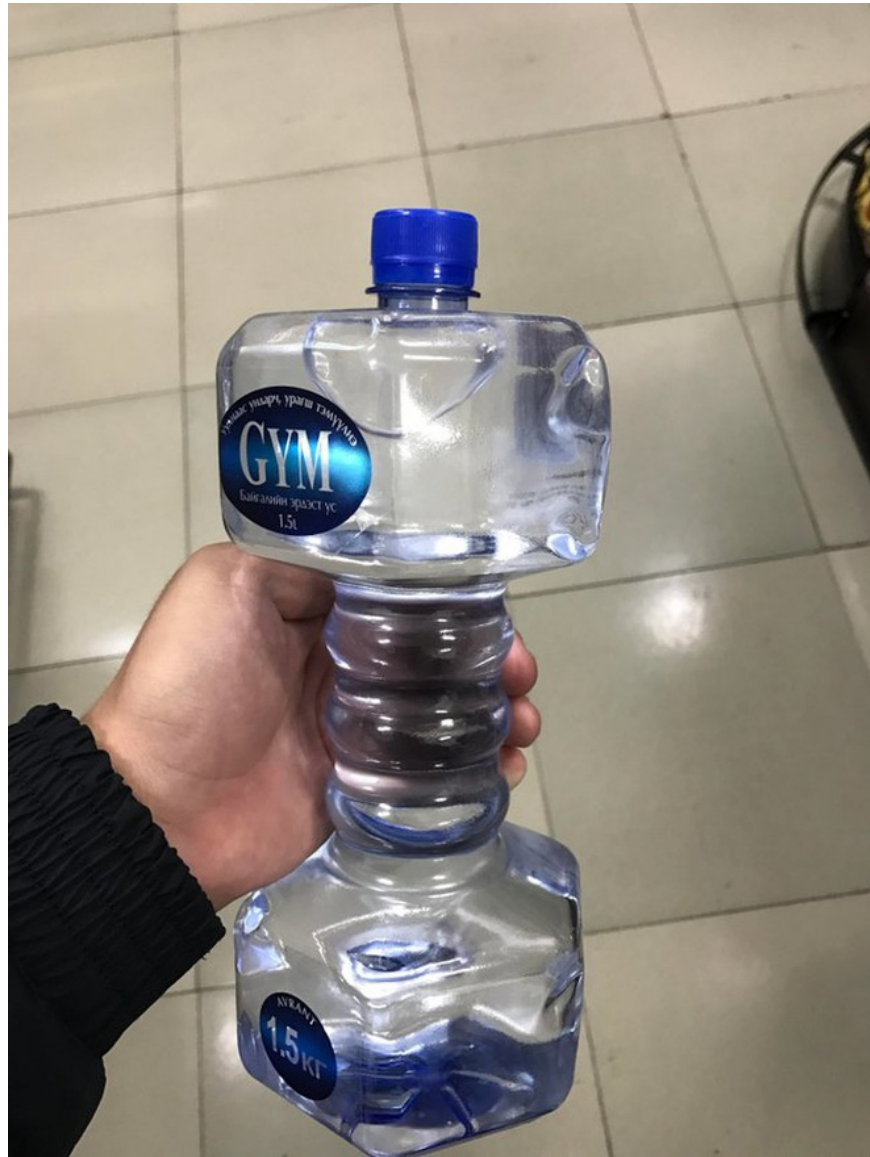
The bottle of a gym, dumb-shaped, filled with water weighs exactly 1.5kg for guests to take home to practice.