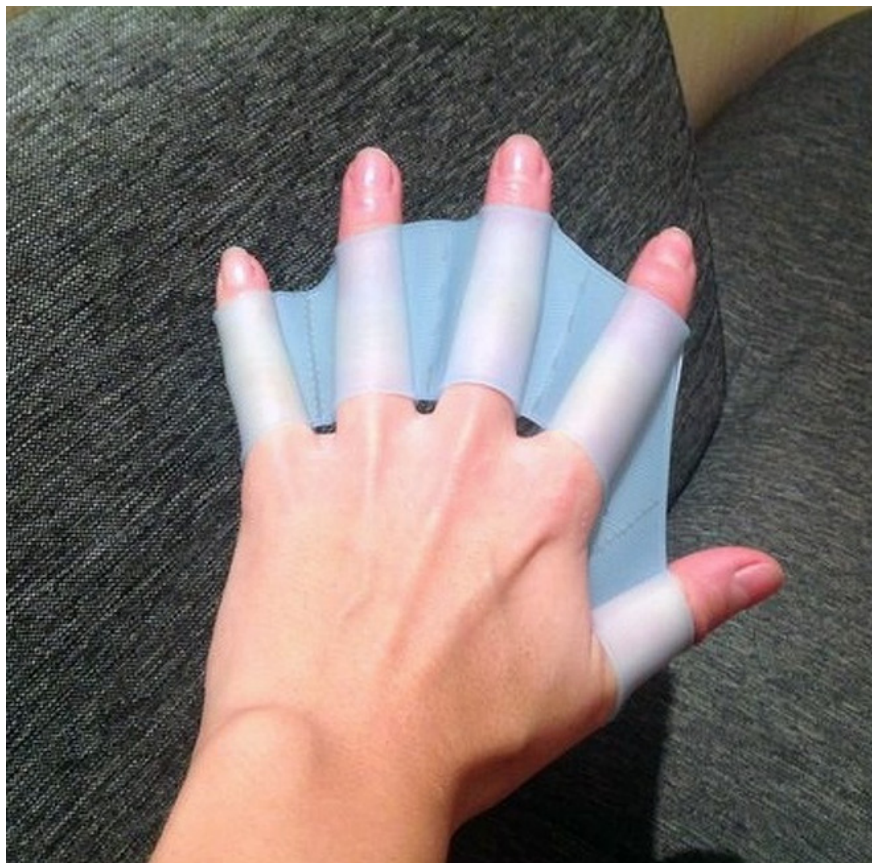
Lying on a chair at the bridge is getting more and more boring, then wearing this toes to swim quickly.