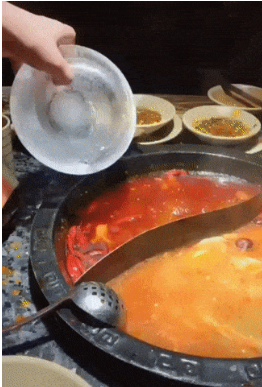
This dish should be applied in Vietnam as quickly as possible: The cold stone bowl, dipped in the hot pot is self-draining all the grease out.