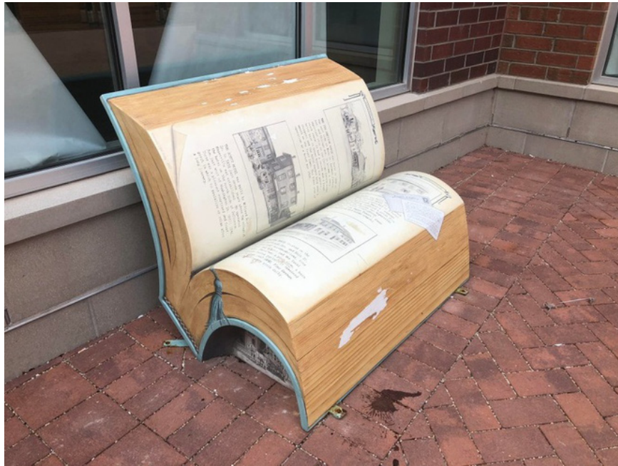
A book-shaped rocking chair, which looks uncomfortable in the butt but is beautiful, isn't it?