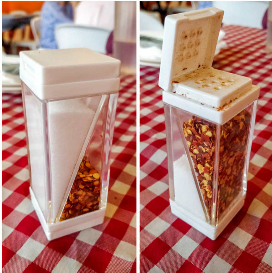
This salt and chili salt combo, buy 1 get 2.