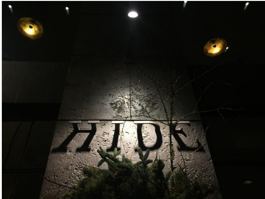
Signboard of a restaurant, serving dinner only so when the lights and then look out the word.