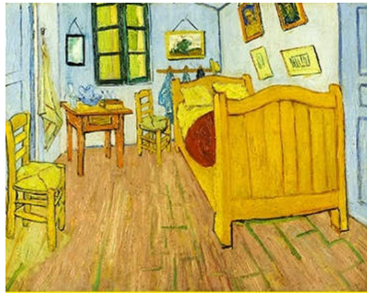
Bedroom in Arles