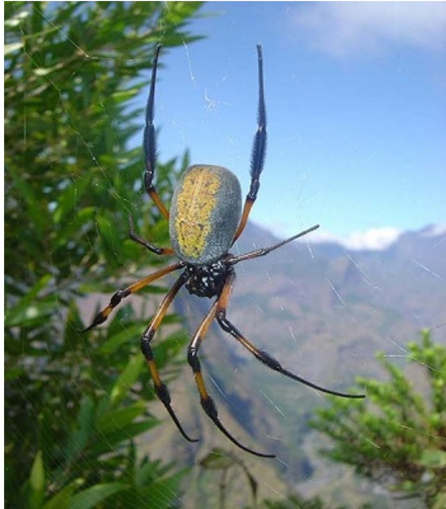
A golden spider weaver spider.

The birth of a yellow scarf proved that spider silk can actually be used to produce fabrics. Spider silk is very strong but very light and elastic. But mass production of spider silk fabric is very difficult because spiders tend to eat at the same time when they are together.