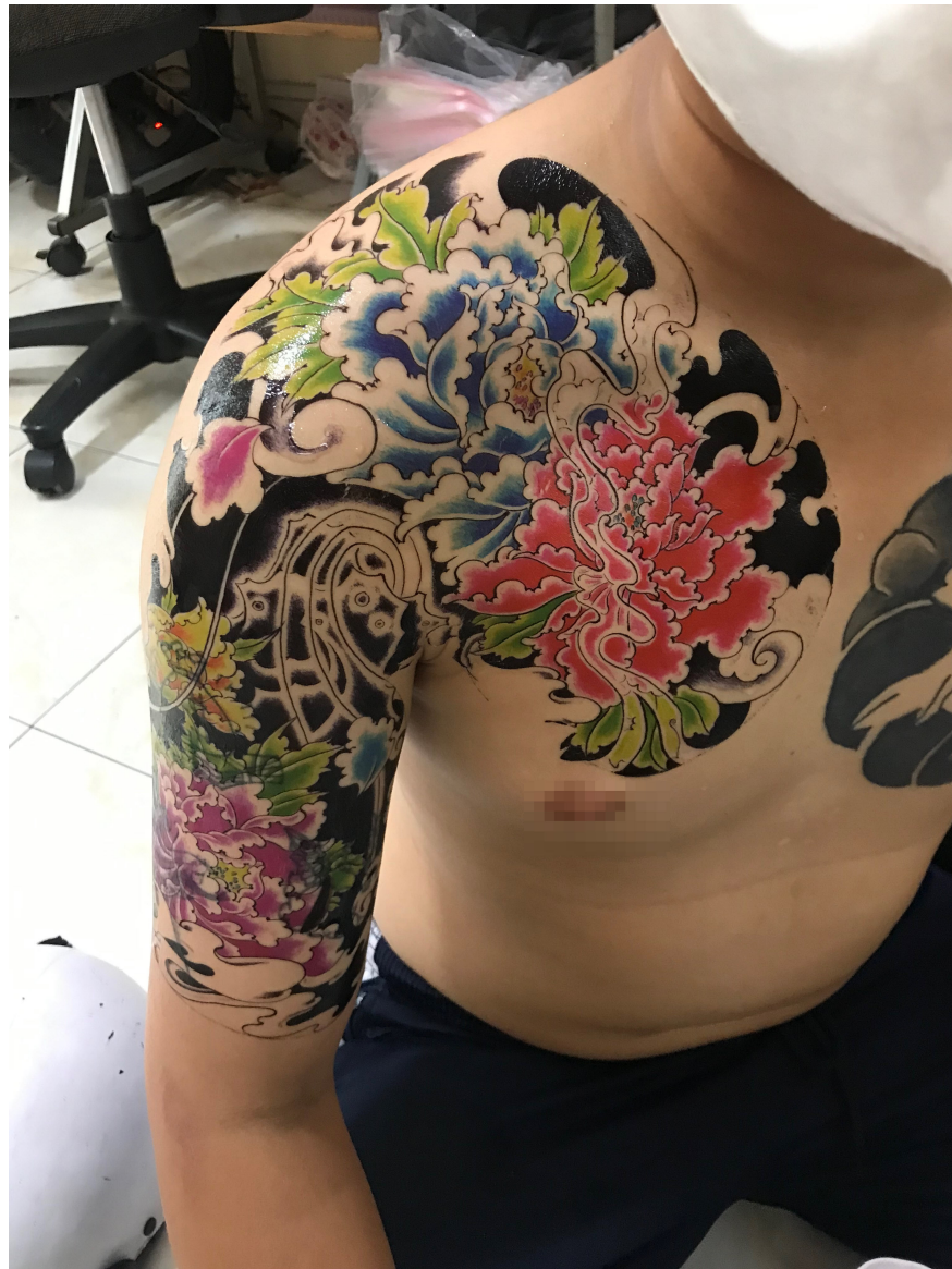
Beautiful Japanese peony flower neck tattoo