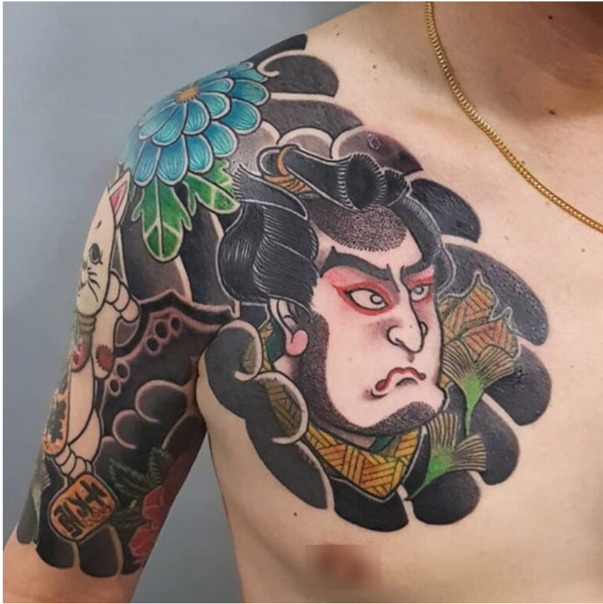
Beautiful ancient Japanese tattoos