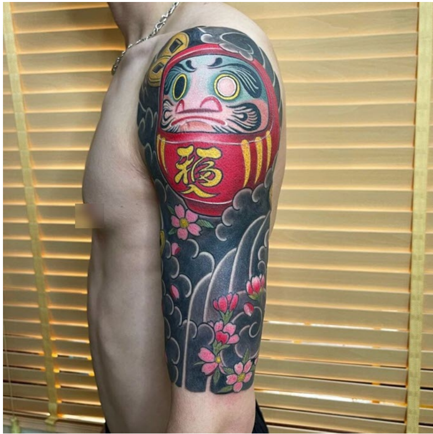
The most beautiful Japanese arm neck tattoo