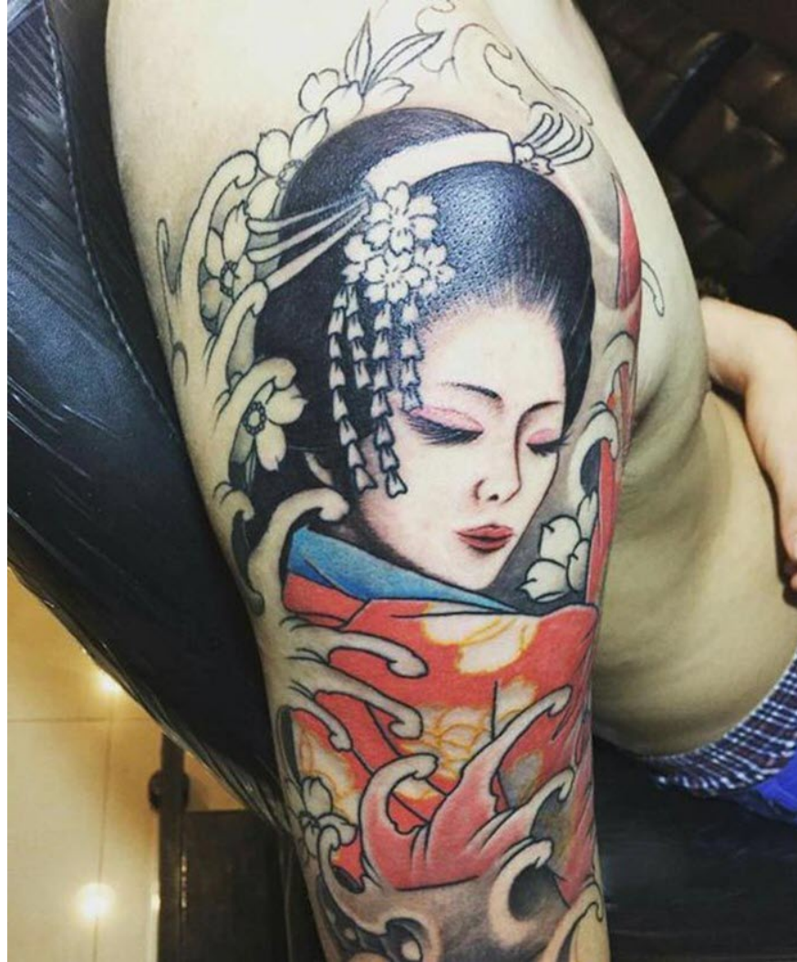
Japanese tattoo on the upper arm of a beautiful girl