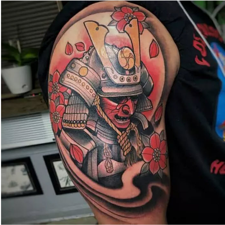
Beautiful Japanese tattoo on Samurai arm neck