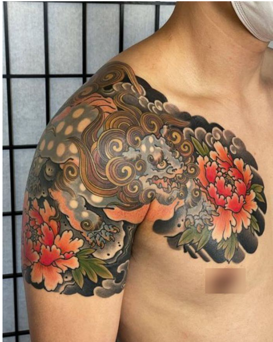
Japanese tattoo on men's biceps with beautiful peony flower shape