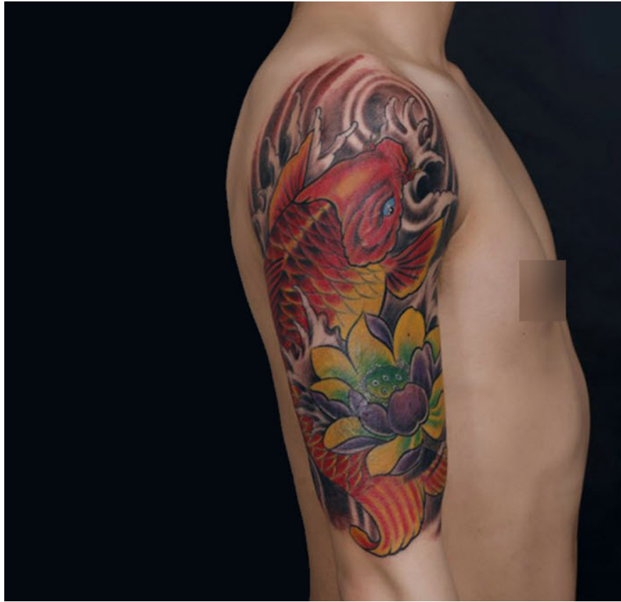
Japanese tattoo on men's biceps