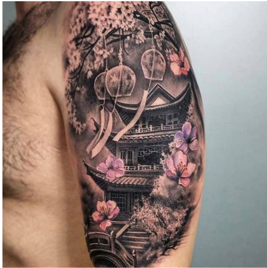
The most beautiful Japanese tattoo on the bicep with cherry blossoms