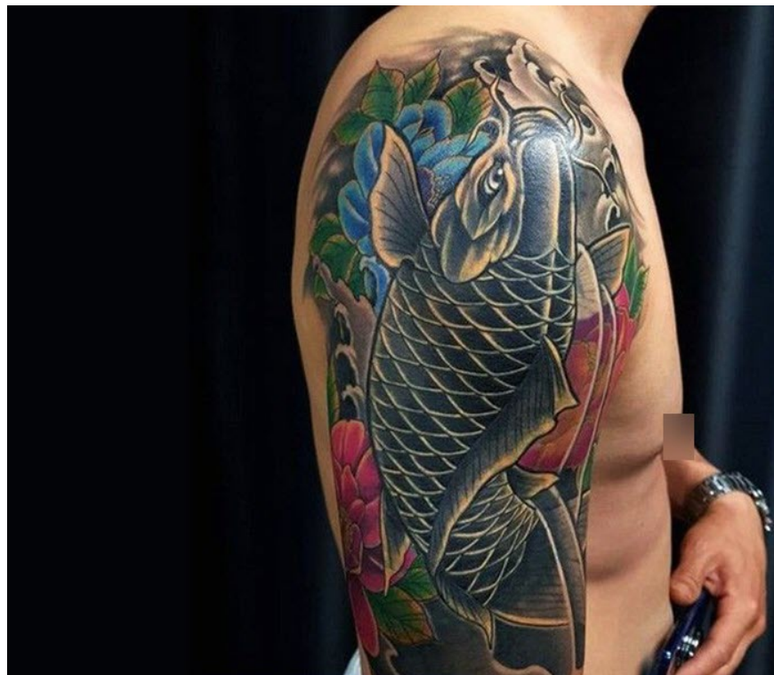
The most beautiful Japanese carp neck tattoo