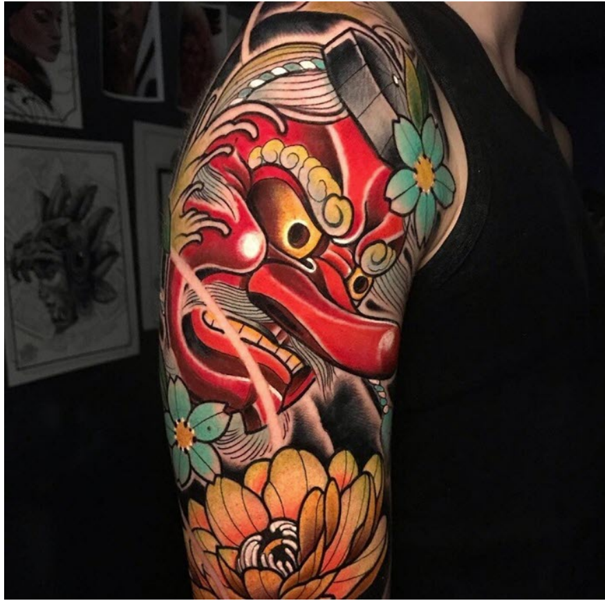
Samurai arm neck tattoo