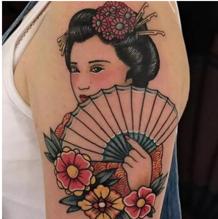
Beautiful Japanese arm neck tattoo