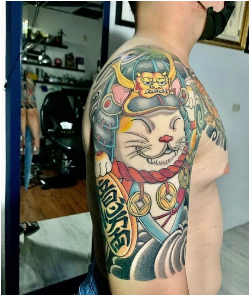
The most beautiful Japanese arm neck tattoos for men