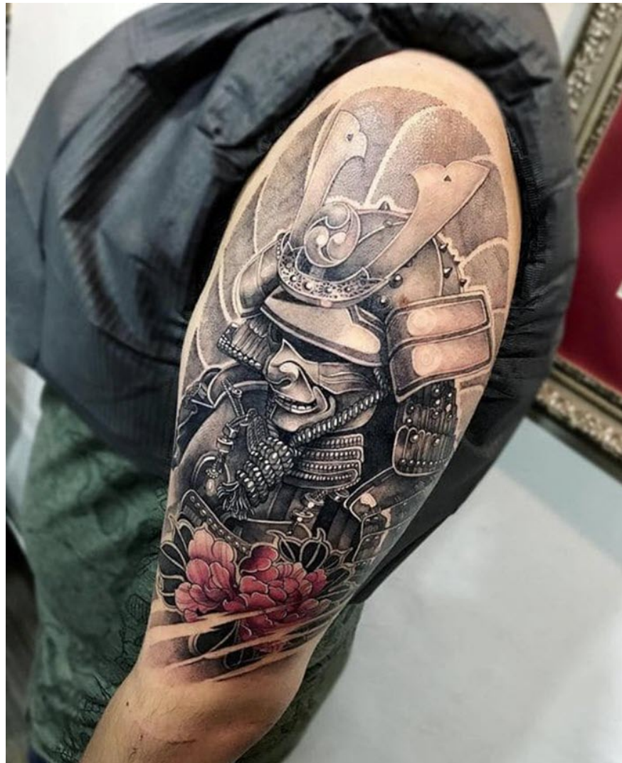
Beautiful Japanese arm tattoo design