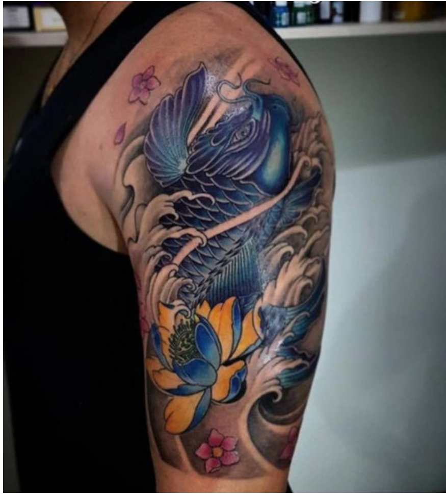
Beautiful Japanese carp tattoo on the bicep