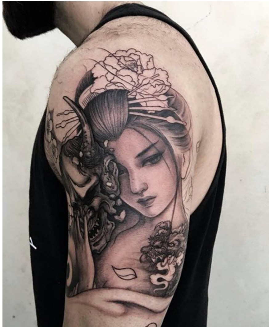
Ancient Japanese tattoo on bicep