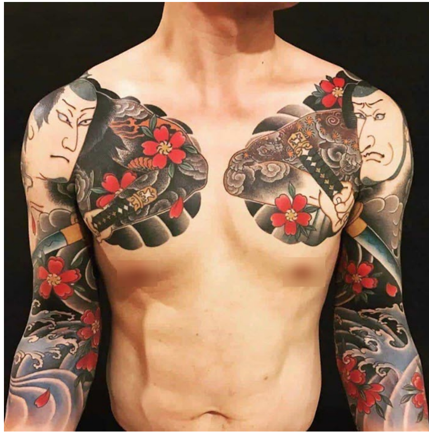
Beautiful Japanese tattoos on the neck, biceps, and chest