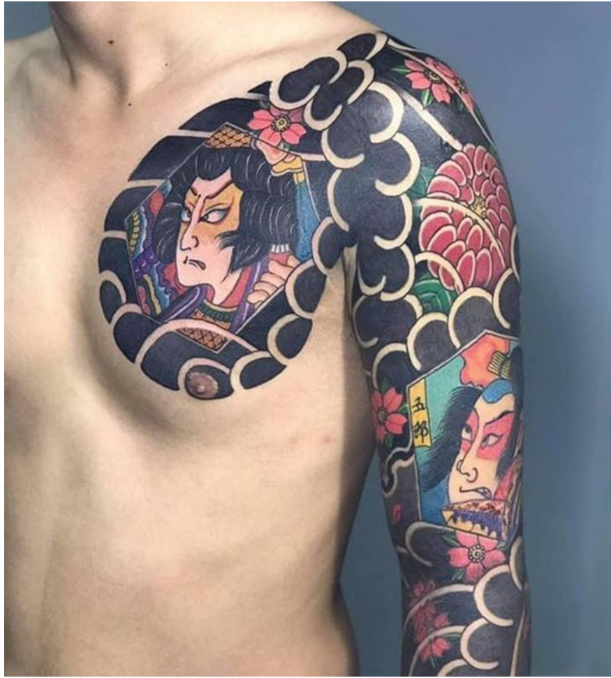
Japanese tattoo design for men's biceps