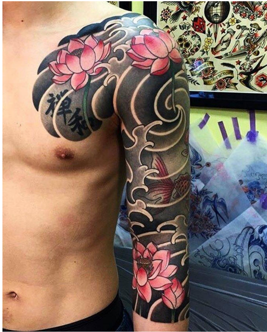
Beautiful lotus-shaped Japanese upper arm tattoo