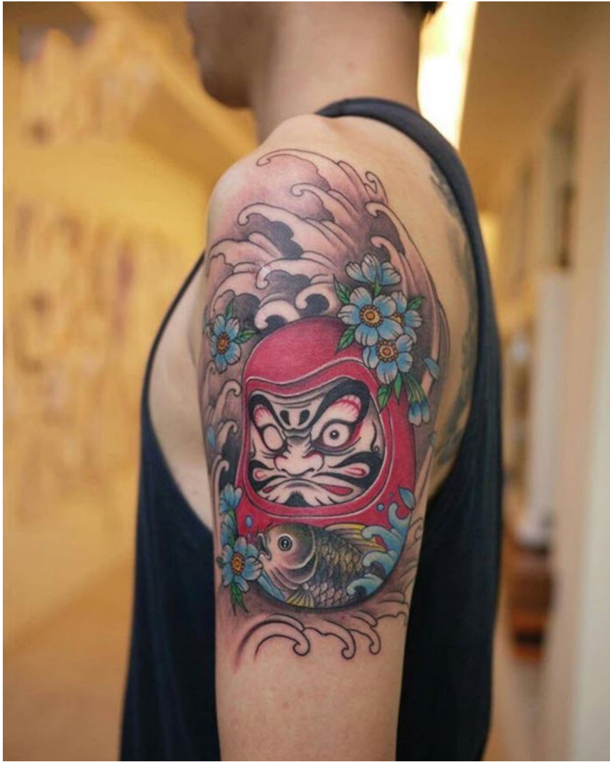
The most beautiful Japanese tattoo on Samurai arm neck