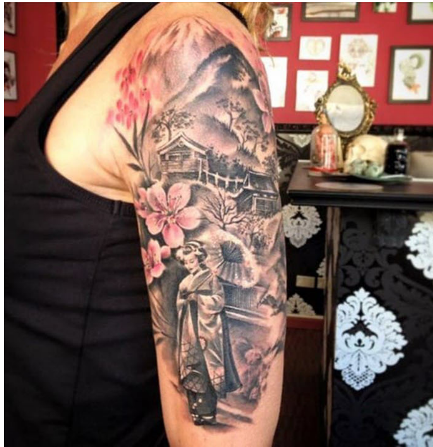
Beautiful Japanese tattoo on men's biceps