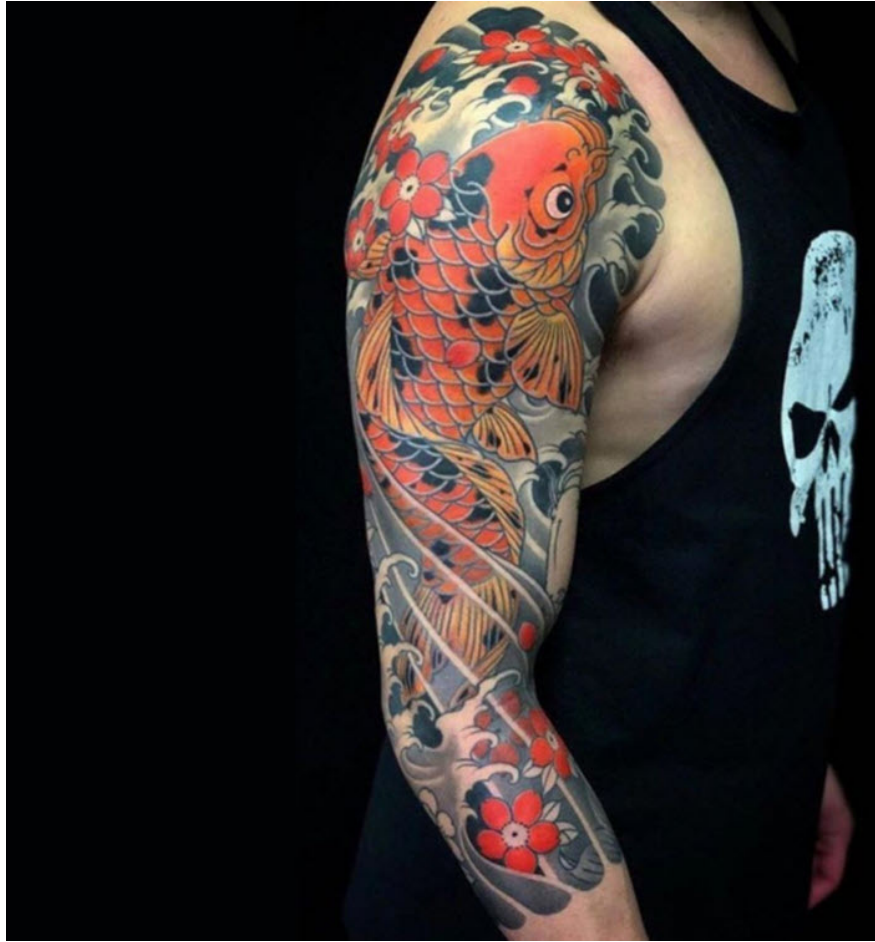
The most beautiful ancient Japanese tattoo design on the bicep