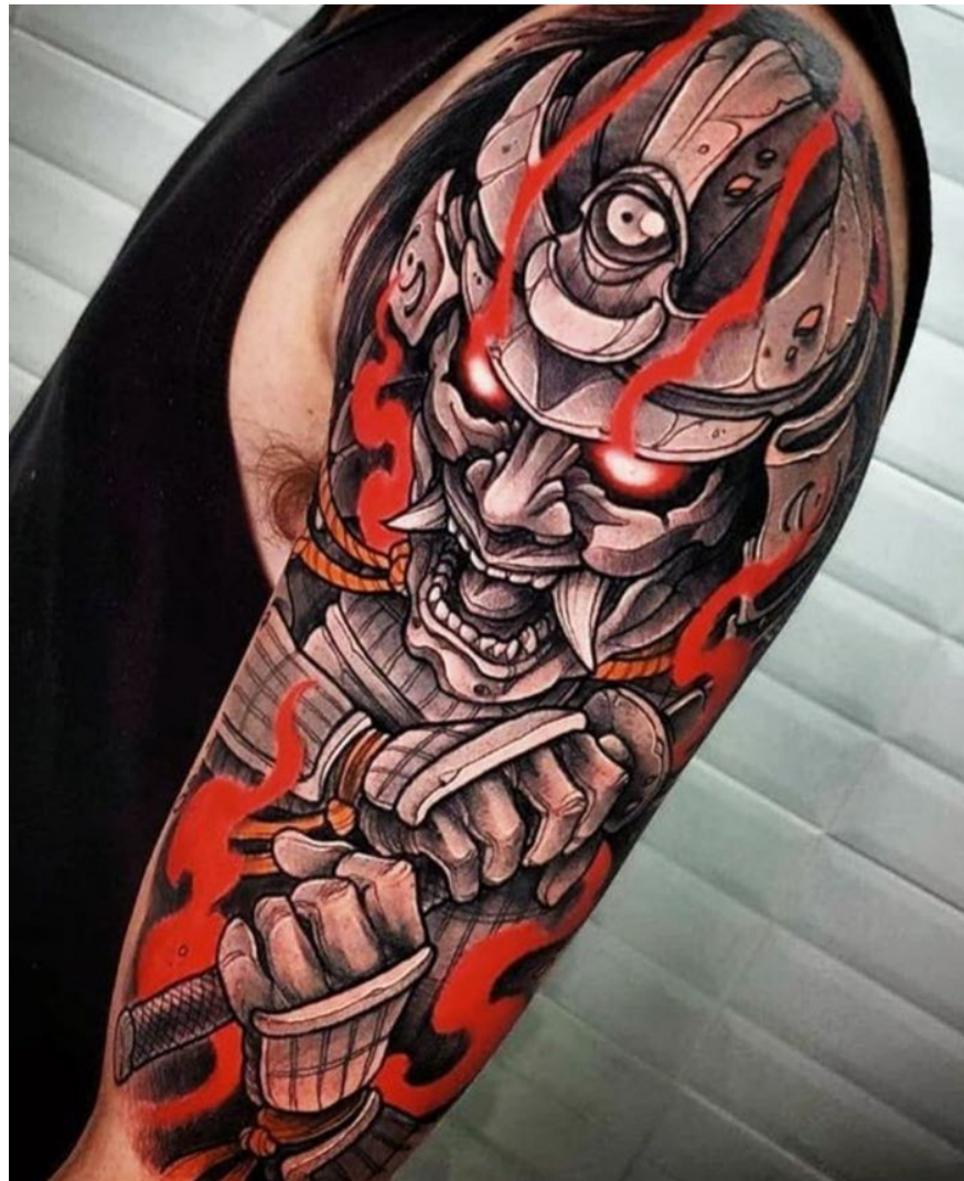
Beautiful Japanese tattoo design for men's biceps