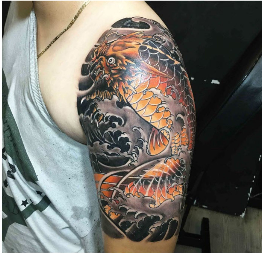
Japanese bicep tattoo of carp