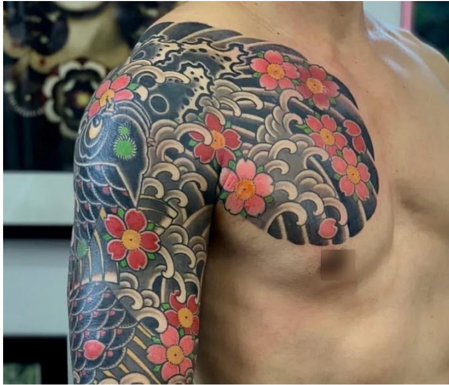
Ancient Japanese tattoo