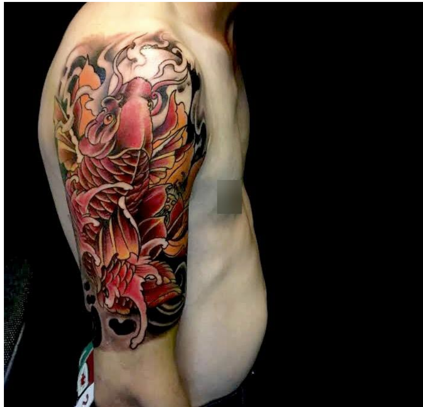
Beautiful Japanese carp neck tattoo