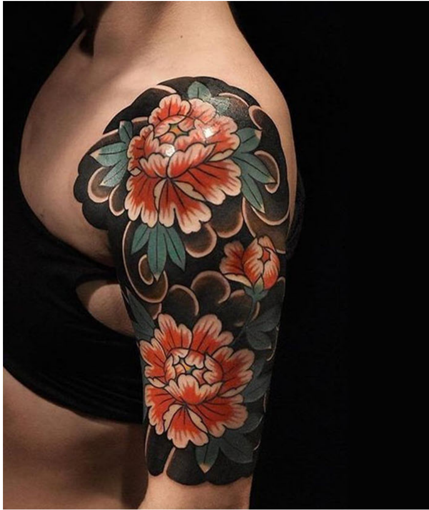
Beautiful ancient Japanese tattoo on the bicep