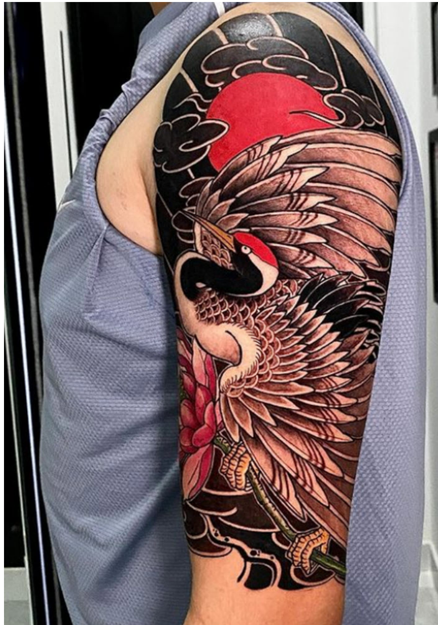
Beautiful ancient Japanese tattoo design on the bicep