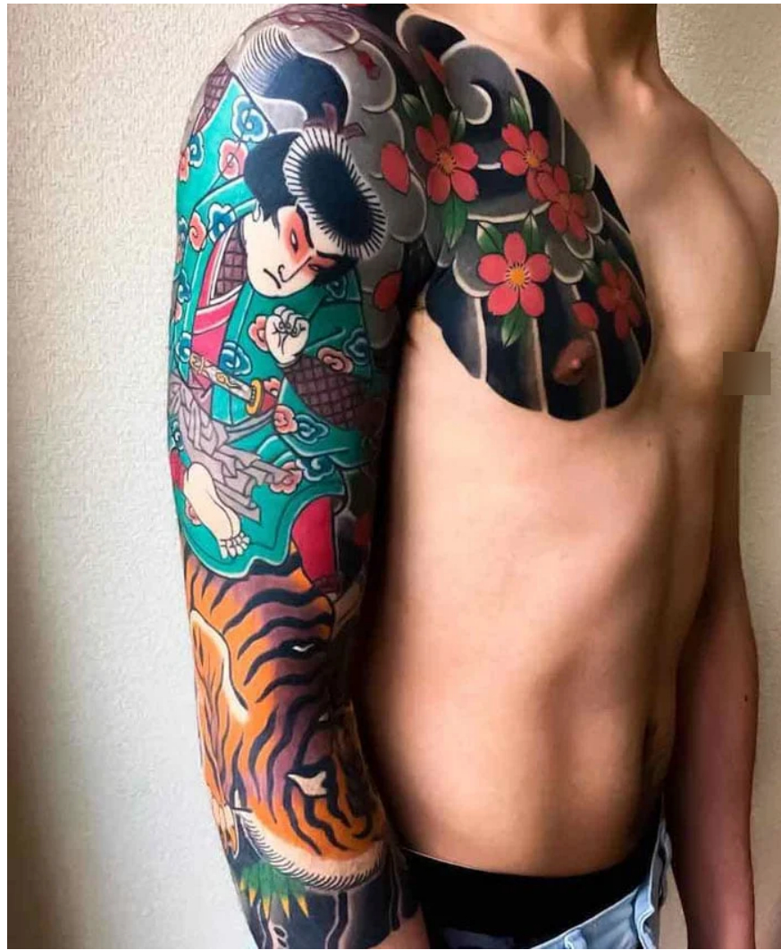
The most beautiful Japanese tattoo design on the upper arm