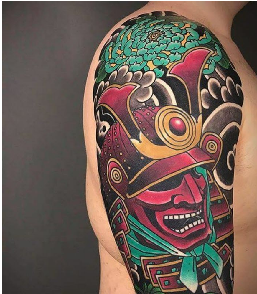
Ancient Japanese tattoo design on bicep

Above, TipsMake has shared with you the most beautiful ancient Japanese tattoo designs on the biceps. Hopefully with these beautiful and meaningful ancient Japanese tattoos, you will choose the most beautiful ancient Japanese tattoo to tattoo on your bicep. Thank you for your interest and following this article.