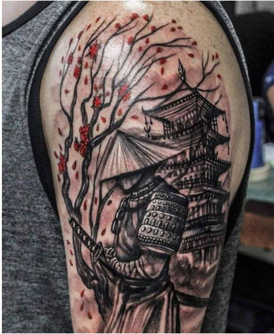
The most beautiful Japanese tattoos on men's biceps