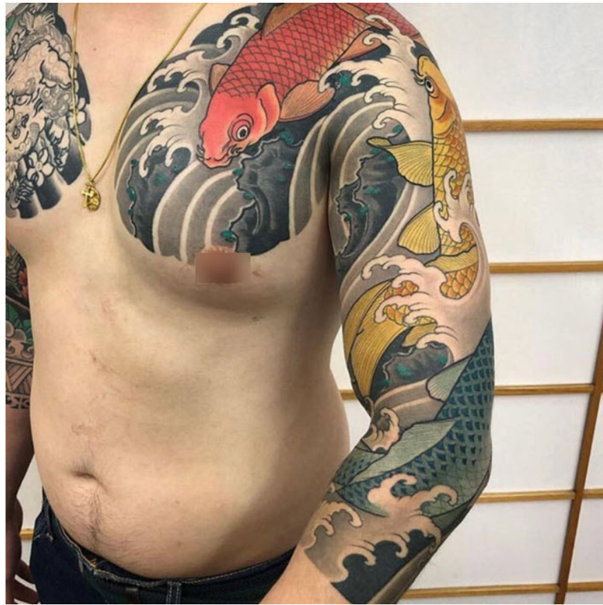
Beautiful Japanese tattoos on the neck, biceps and chest