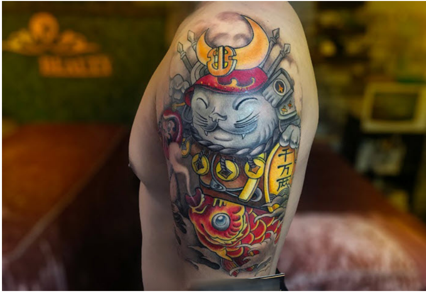
The most beautiful Japanese tattoo on the upper arm of the lucky cat