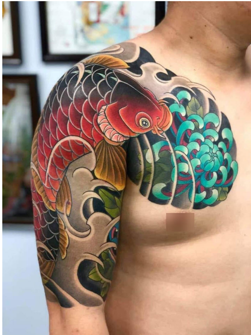
The most beautiful Japanese arm tattoo design for men