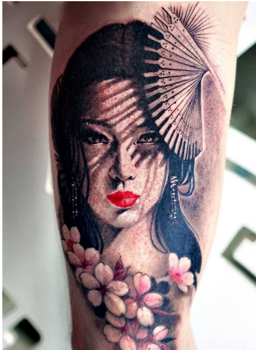
Japanese arm neck tattoo of a beautiful Geisha girl