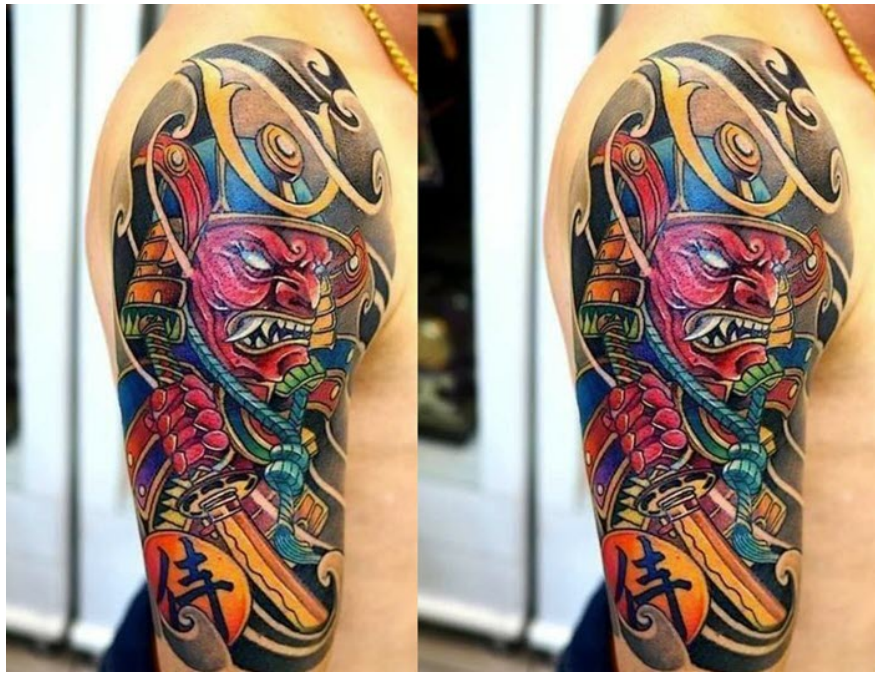
Japanese tattoo design for biceps neck