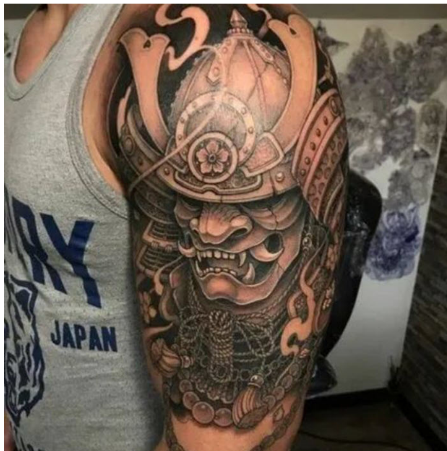
Beautiful Japanese tattoo on the forearm with a Samurai image