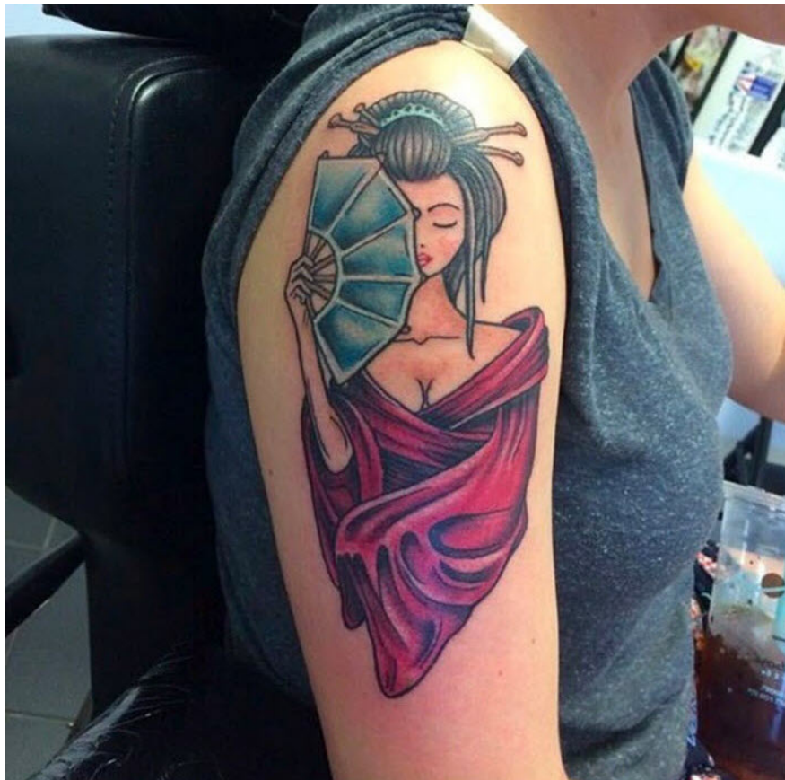
Japanese arm neck tattoo design for men