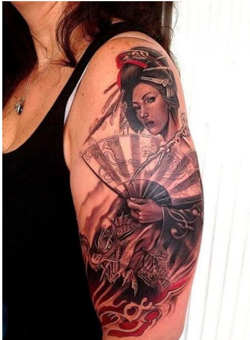
Beautiful Japanese tattoos on women's biceps