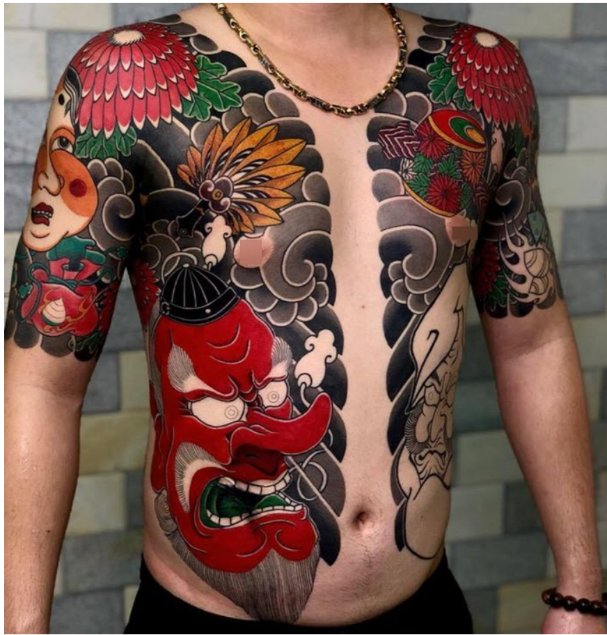
The most beautiful Japanese tattoos on the biceps and chest