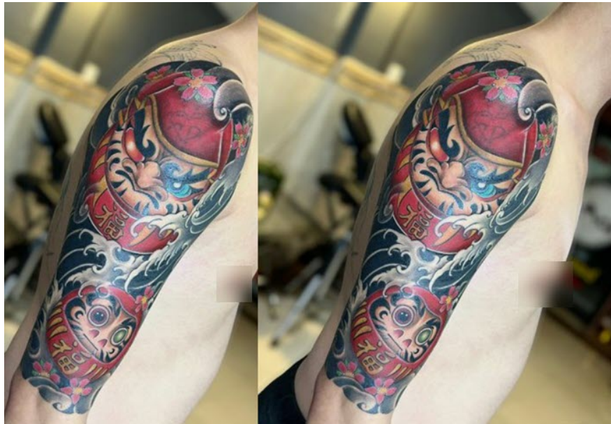
Gorgeous Japanese arm neck tattoo