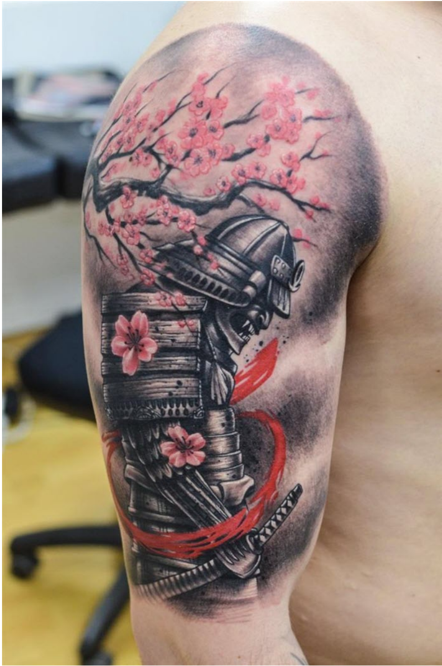
Japanese arm neck tattoo