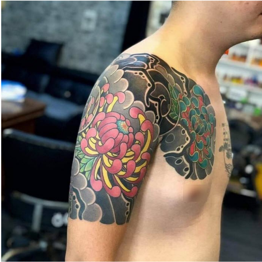
The most beautiful ancient Japanese tattoos