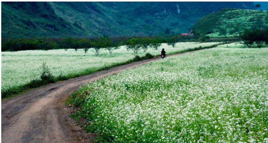
8. Gun flowers