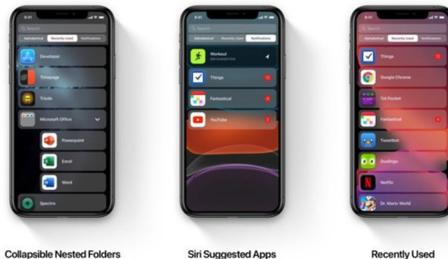
iOS 14 List View Homescreen Visualization

According to this mockup, users will be able to switch between list modes to see all apps from AZ, sort apps by last used time, and show only apps with notifications. Italy. The Spotlight search box is always on screen to help