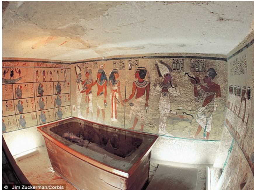
Inside Tutankhamun tomb

They used modern technology to analyze Tutankhamun's mummy and discovered that the legendary pharaoh had some health problems and had to use a walking stick to move. But the cause of the sudden death of young Pharaoh Tutankhamun is still a controversial mystery. Some suggested that he was assassinated, but there was evidence that he died of illness.