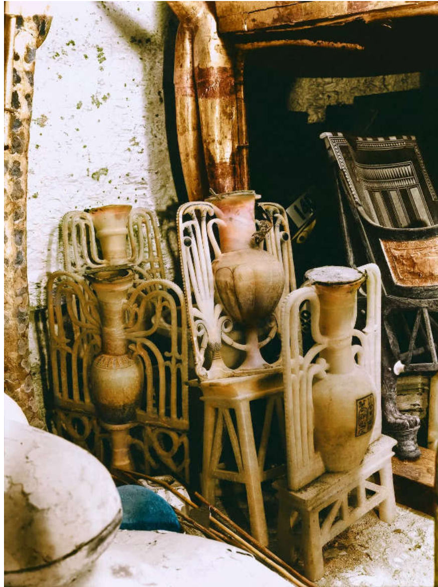
The pots are elaborately crafted with plaster.