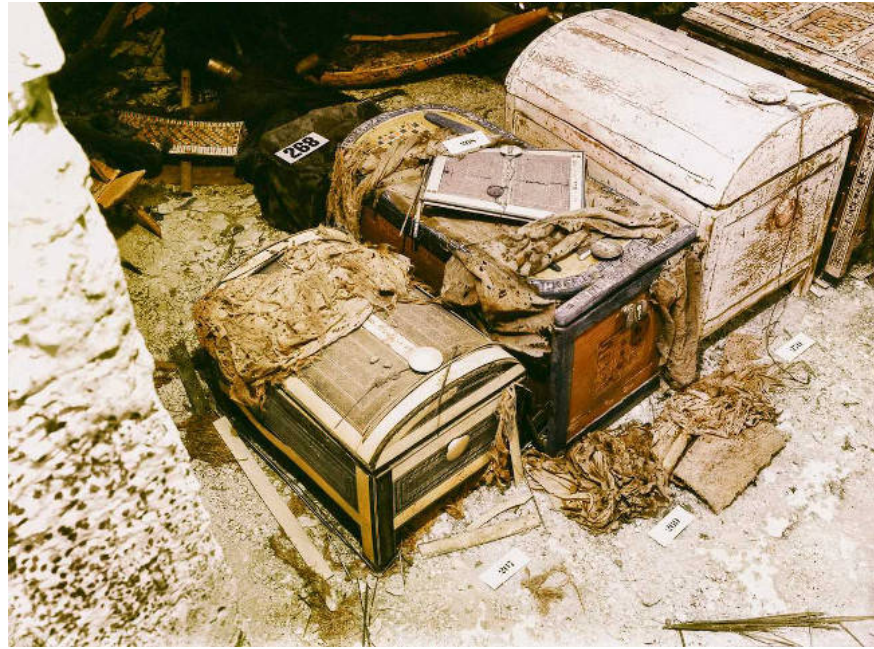
The chests contain lots of jewelry, clothes and cosmetics. They are made of ivory, ebony, and Egyptian red wood.