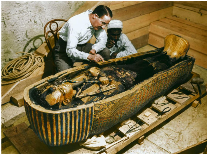
Carter and an employee were checking the golden coffin.