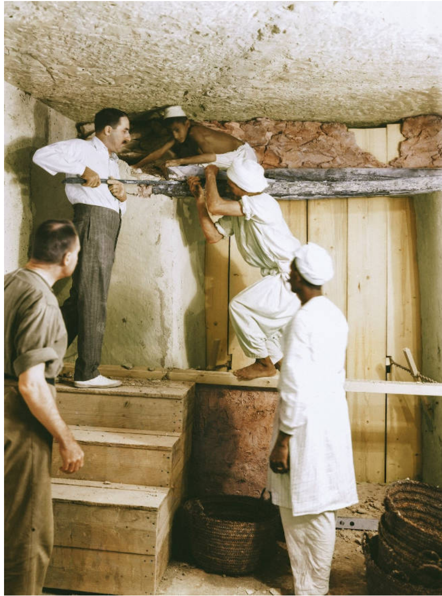
The wall between the outer space and the burial chamber inside the tomb was removed.