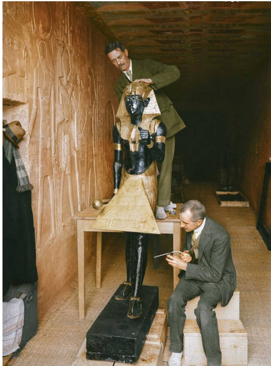
A statue of a guard is being cleaned right in the crypt.