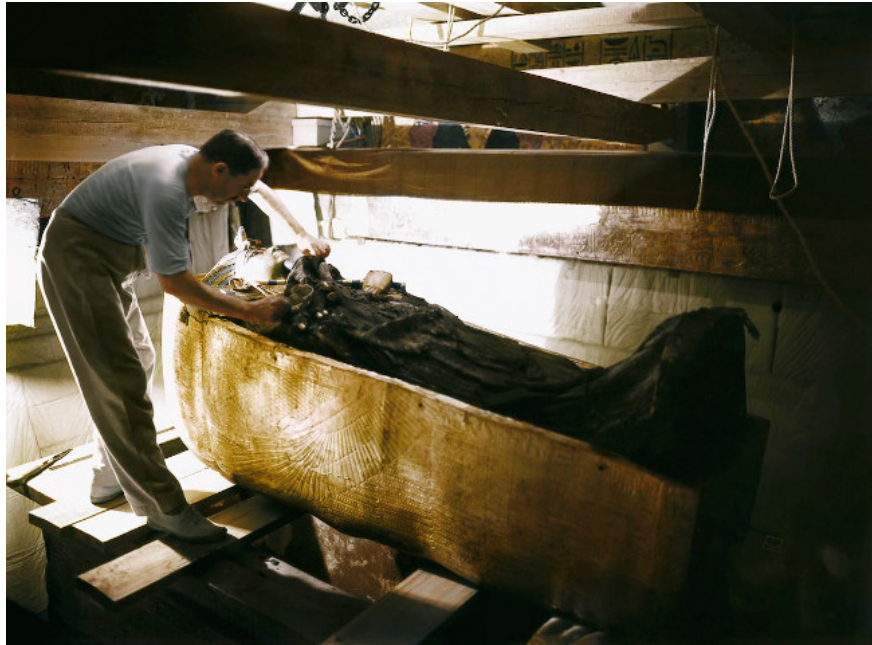
Archaeologist Howard Carter is carefully examining the body of Pharaoh Tutankhamun.