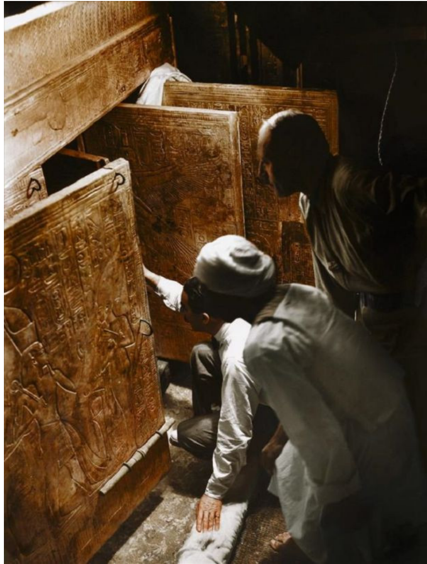
Archaeologists open doors to the deepest corner of the tomb.