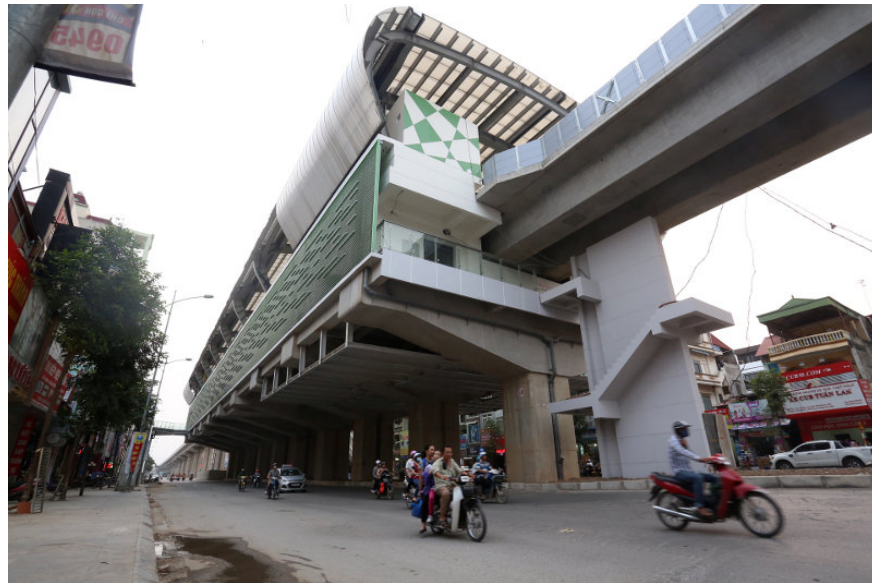
The modern La Khe model station looks from Quang Trung street.