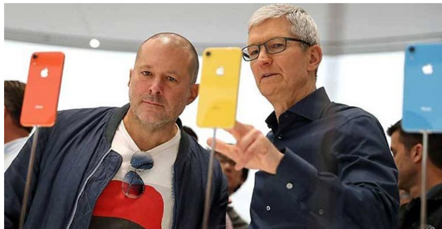
Jony Ive and CEO Tim Cook during the iPhone 5c launch

Leaving aside the contradictions about Jony Ive's role at Apple, we talk about the change in his product design philosophy. The most obvious is the change in the material selection and design style around that material. Over time, he switched from 'love' to light-colored plastic on the iMac and iBook, to the most homogeneous and final white designs of aluminum and glass, which still dominate the Apple product line for to this day.