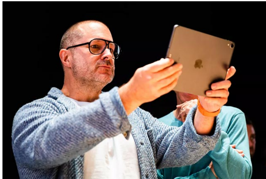
Jony Ive and the iPad

Jony Ive started his adventure at Apple in 1992, as one of the important members of the design department, where he played a huge role in the launch and success of computer models. Unique handheld Apple Newton.