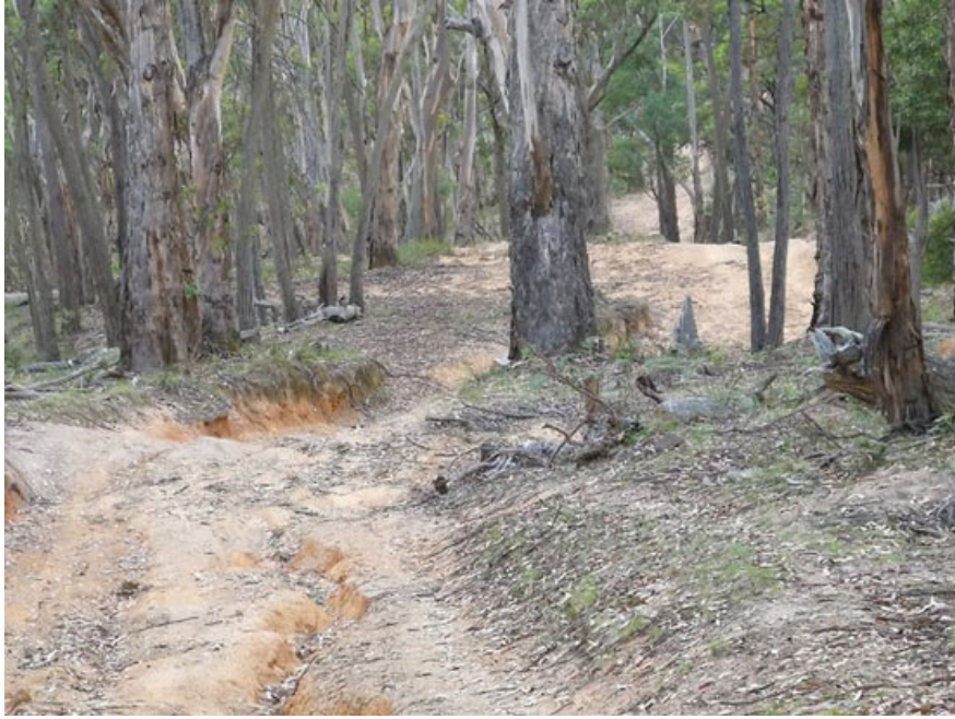
After crossing a steep, rough road about 500 meters, Bruce descends on a mountain.