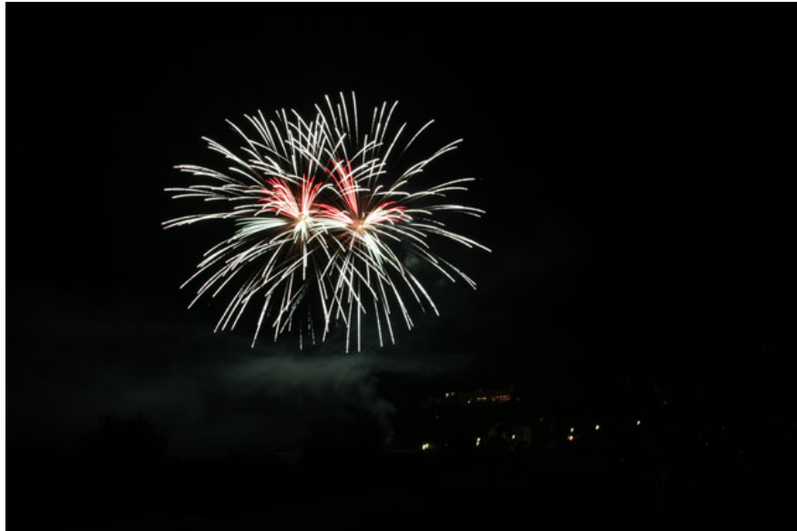
Synthetic fireworks wallpaper