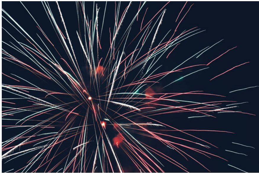
Beautiful fireworks pictures