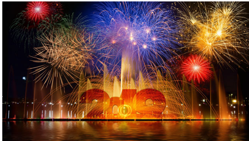
Firework wallpaper for computer

Also, if you want to save this meaningful moment, the photographer must make sure the camera is kept in place (tripod tripod is recommended). With digital travel cameras (point-and-shot), it is recommended to switch to Firework or Nightshot mode. With DSLR series, it is necessary to reduce the light sensitivity (ISO) to avoid image noise and to set a small aperture.