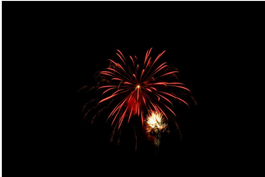
Beautiful fireworks photos