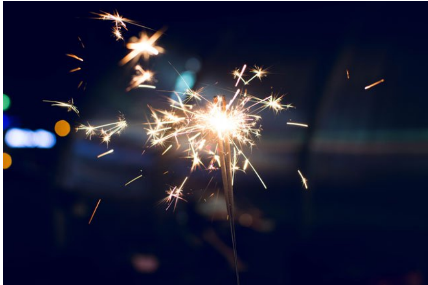
Fireworks photos for laptops