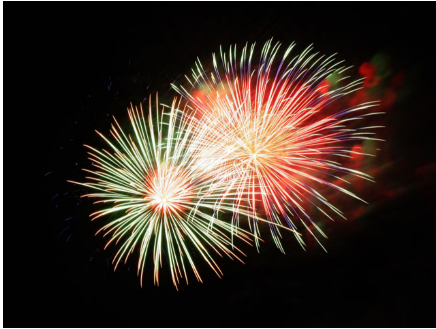
The most beautiful fireworks wallpaper