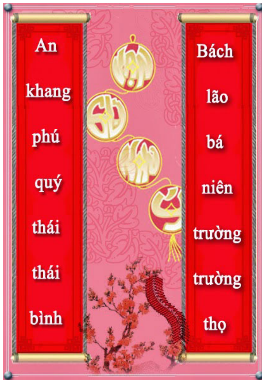
An abundance of peace and gentleness - Bach old school year long