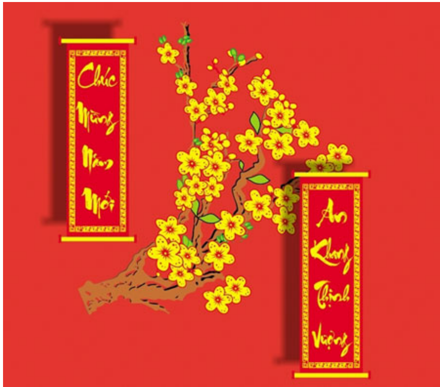
Happy New Year - An prosperous and prosperous