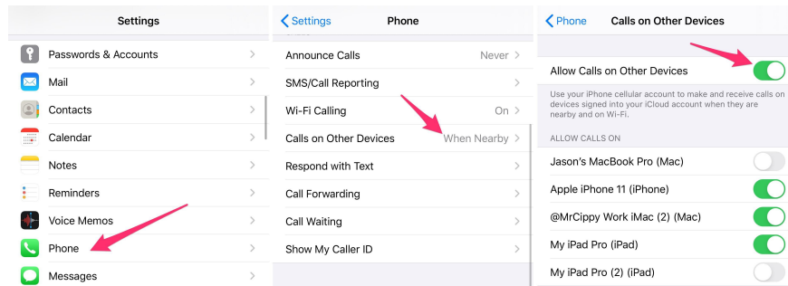
Picture 2 of Stop incoming iPhone calls from ringing all your other Apple devices