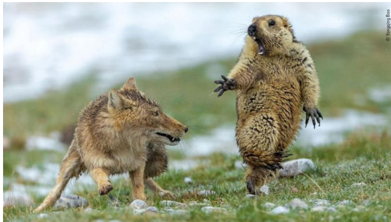
Moments - First prize in the Wildlife Photography Competition 2019.

The first prize in the Wildlife Photography Contest 2019 found the 'owner' which was a 'Moment' photo, taken by Chinese photographer Yongqing Bao. The picture perfectly captures a startled squirrel when he encounters a wolf, from the pose to the squirrel's facial expression during the moment of danger.