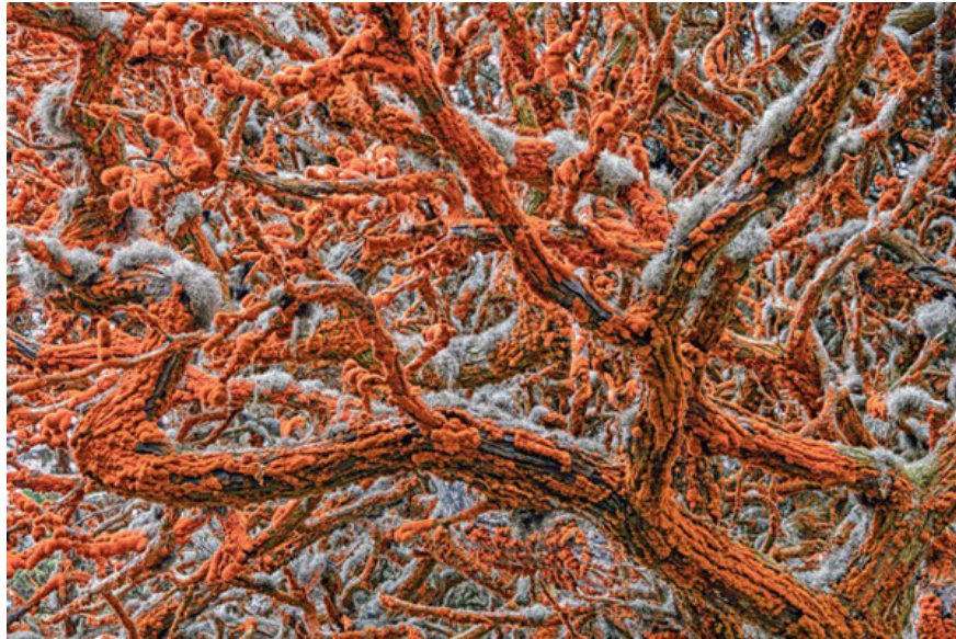
Photo of Zorica Kovacevic, USA won the botanical and mushroom award.