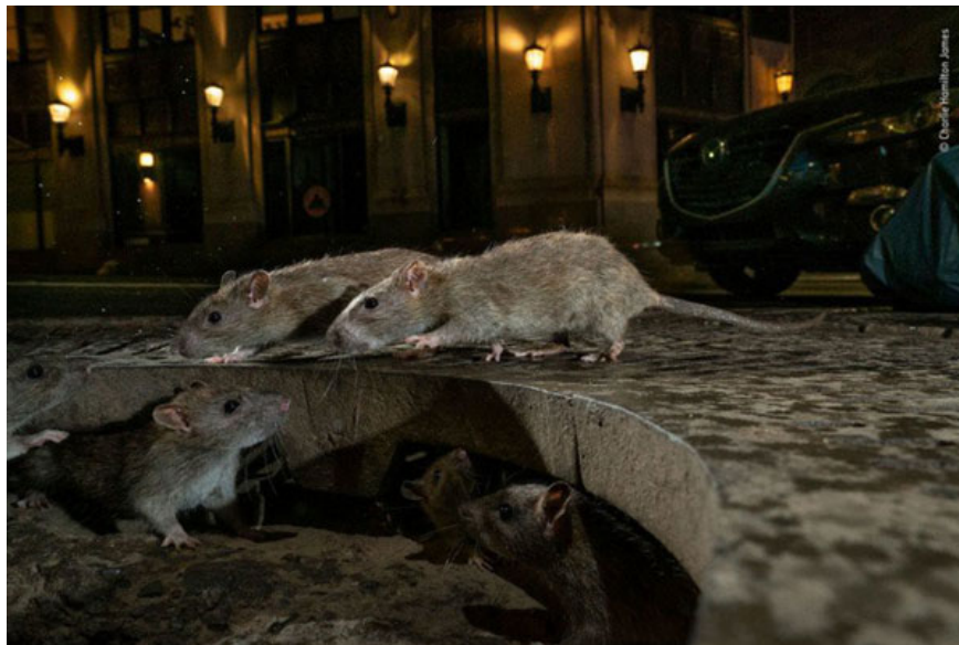
Photo of winning an animal category in the city of Charlie Hamilton James, UK.