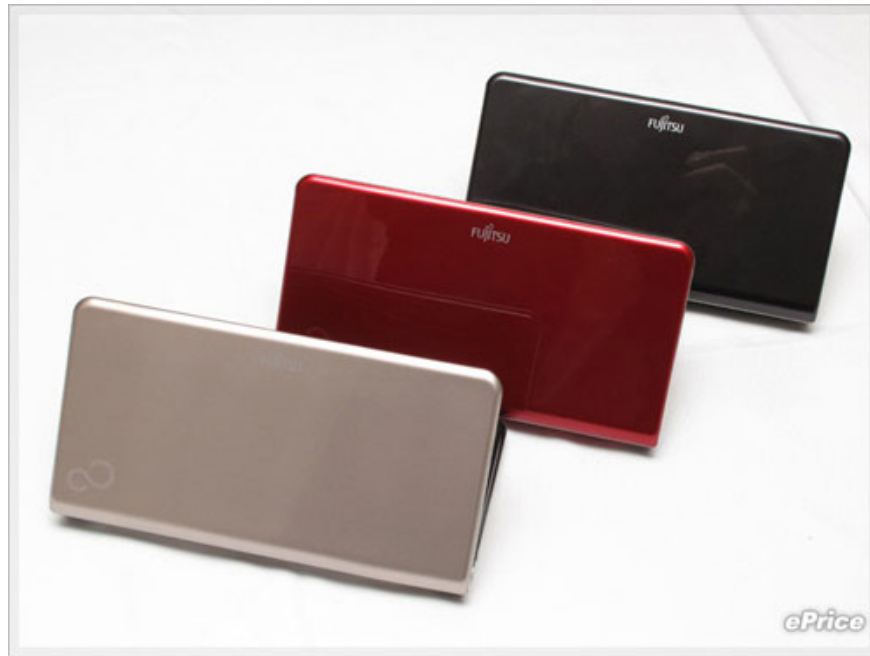
Seven-ball, three-color design.