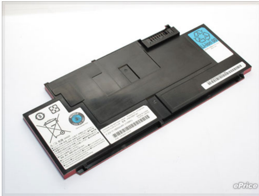
3 cell 1800mAh battery.