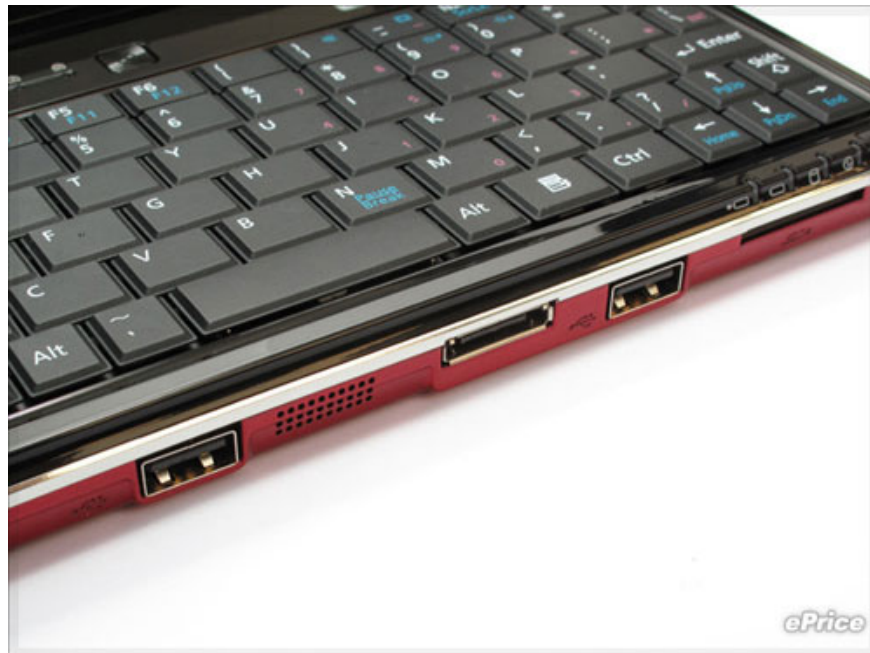
Connection ports at the front edge.