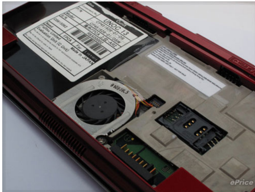
SIM slot, 3G mobile connection.