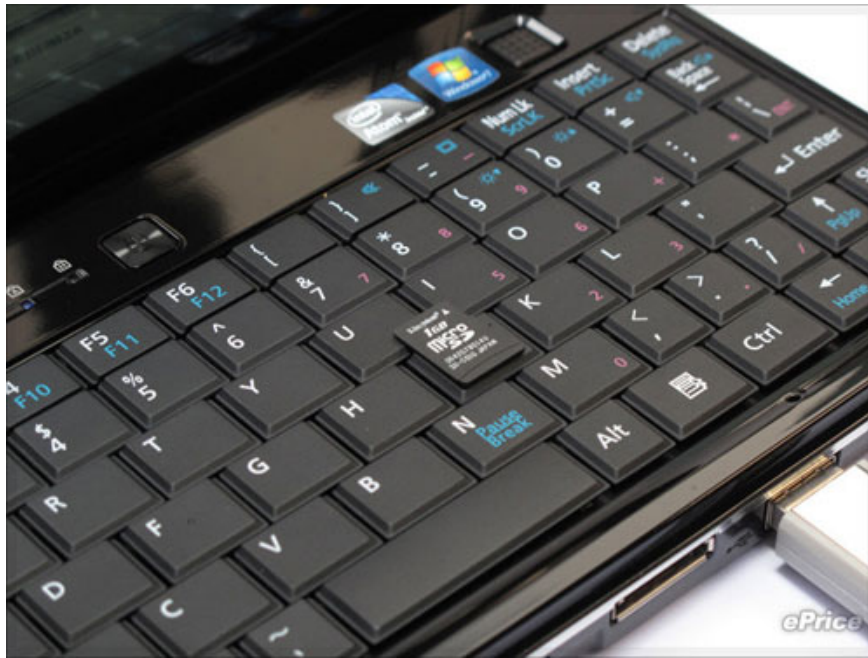
Full keyboard with miniature keys.