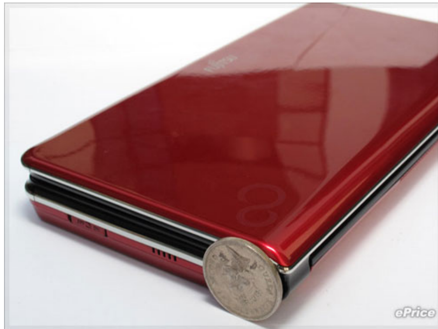
Super compact size, 204 x 106.5 x 23.8 mm.