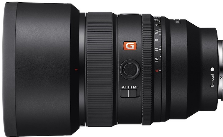
FE 85mm F1.4 GM II Lens.

Sony has just launched the FE 85mm F1.4 GM II lens (SEL85F14GM2) which integrates two XA (super aspherical) lenses and two ED (extra-low dispersion) lenses. This combination provides uniform high resolution across the entire frame. Furthermore, Sony's exclusive Nano AR Coating II technology helps suppress flare and ghosting.