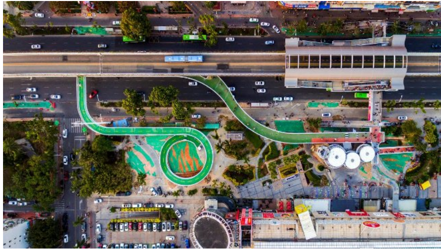
Photo source: DISSING + WEITLING architecture This elevated road is located at a height of 5m above the ground .