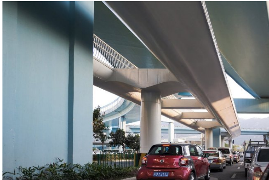
Photo source: DISSING + WEITLING architecture . and located just under the newly upgraded bus line, also known as BRT road, in the central area of ??Xiamen. Xiamen Road has transit points so cyclists can use public transport to certain locations.