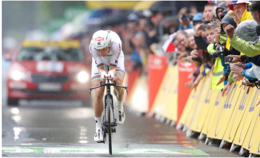
World champion Tony Martin (Katusha-Alpecin) finishes fourth with Canyon Speedmax CF.