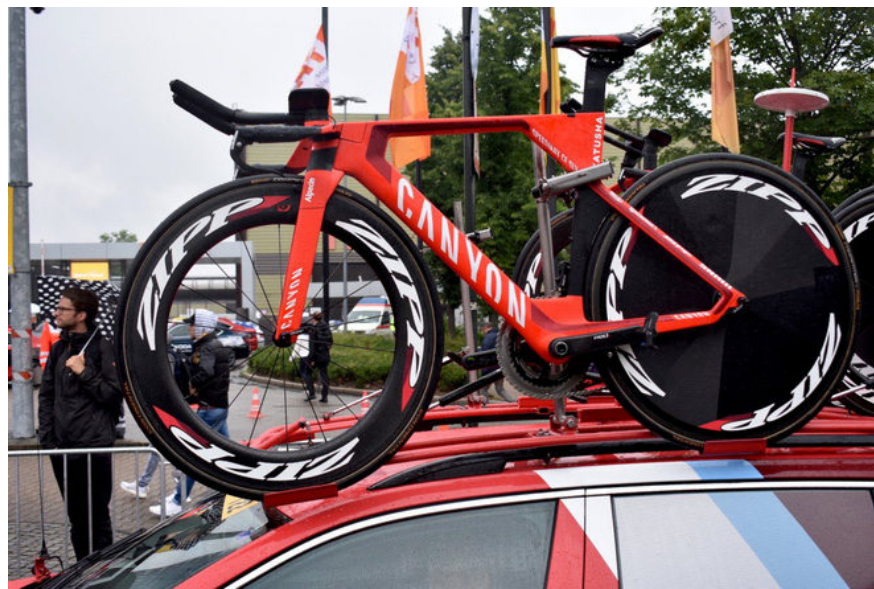
Katusha-Alpecin's Canyon Speedmax CF.