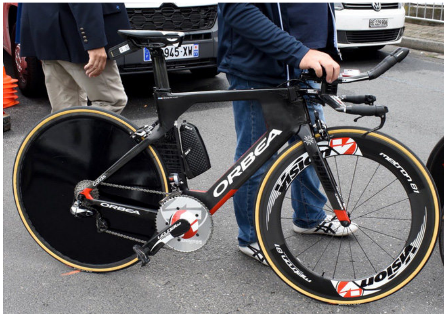
Cofidis-Solutions Crédits team brings this year's race the Orbea Ordu TT.