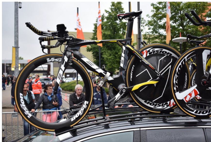
Team Direct Energie brought BH Aerolight TT to attend the 2017 Tour de France.