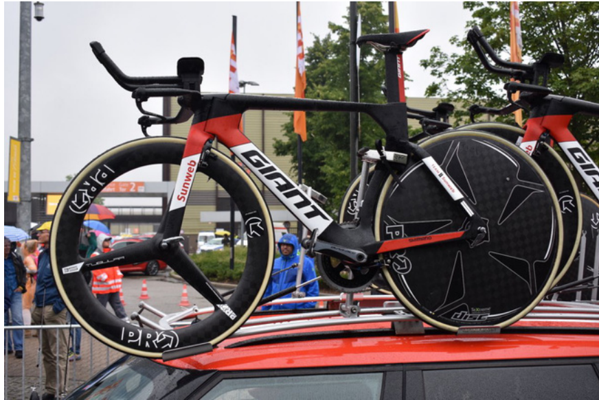
The Giant Trinity Advanced Pro TT of Sunweb racing team.