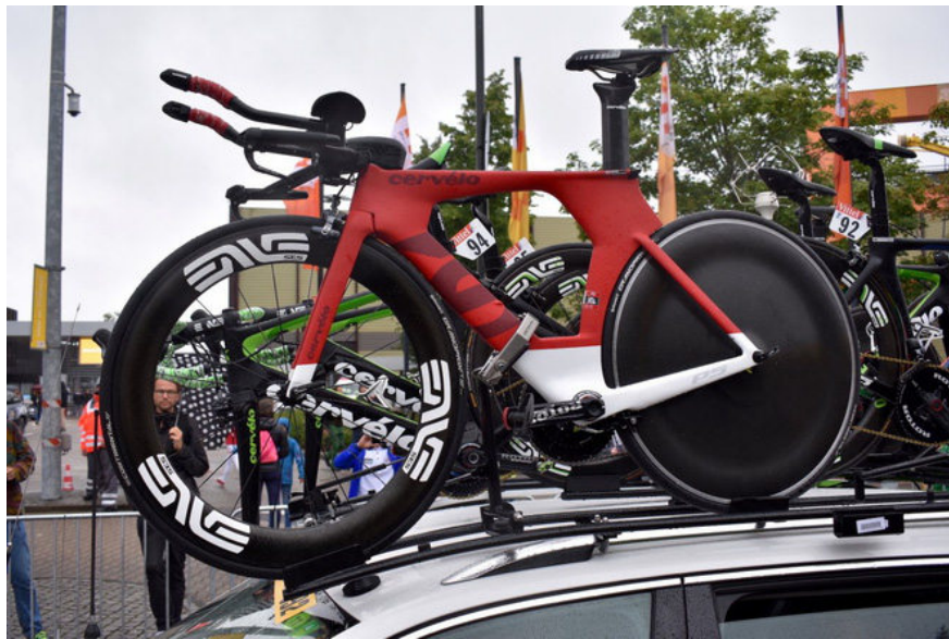
The Cevélo P5 of Dimension Data racing team.