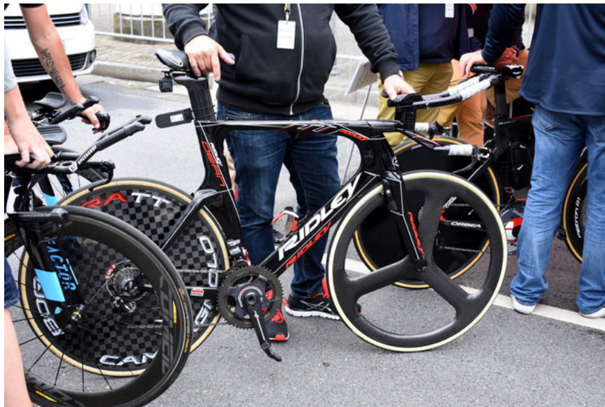
Lotto-Soudal team and Ridley Dean TT race car.