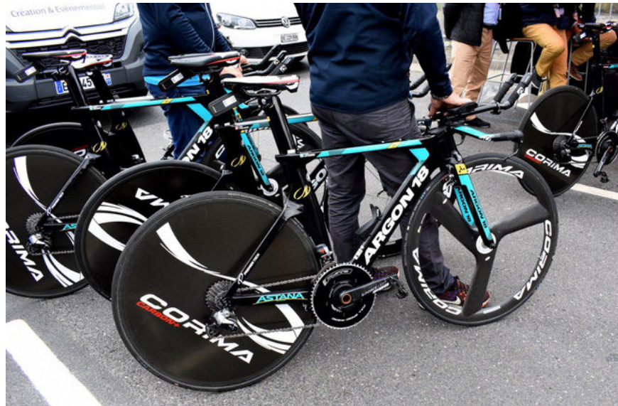
Argon 18 E-118 Next TT model.