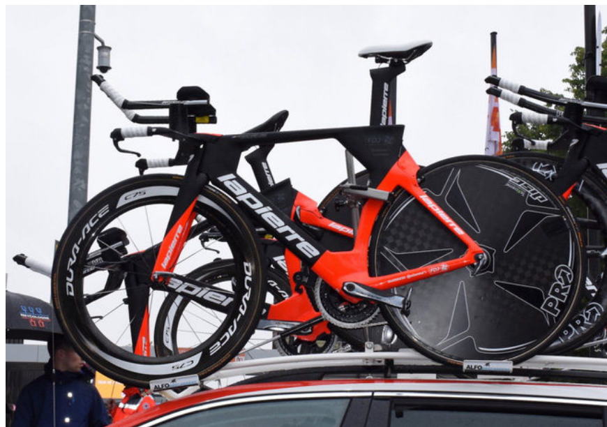
The car Lapierre Aerostorm DRS TT of FDJ team.