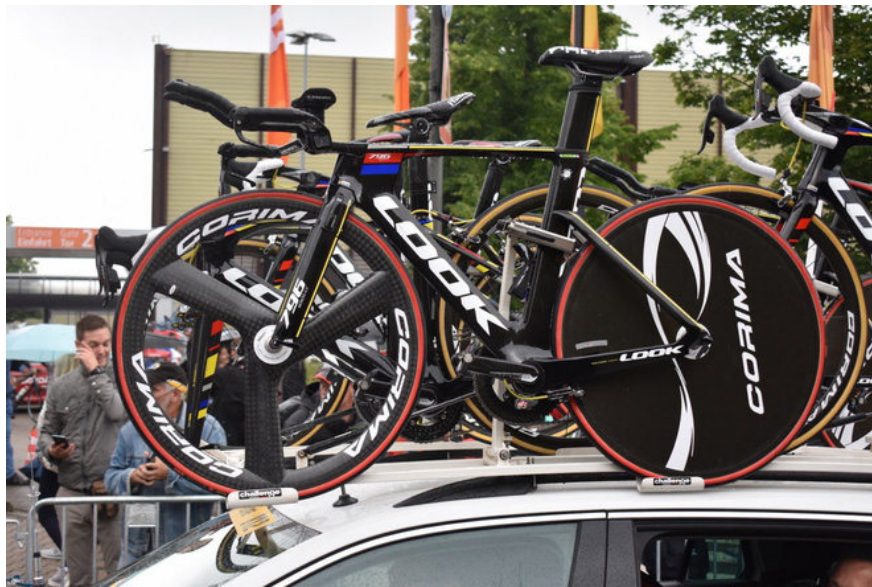
Look 796 Monoblade TT of Fortuneo-Oscaro team.