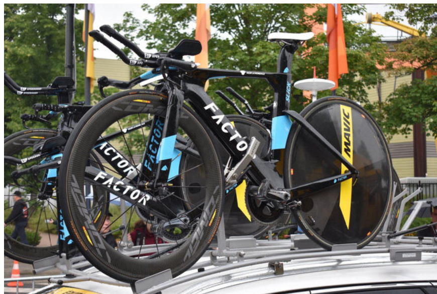
The AG2R-La Mondiale team of France used the Slick TT Factor for this year's race.