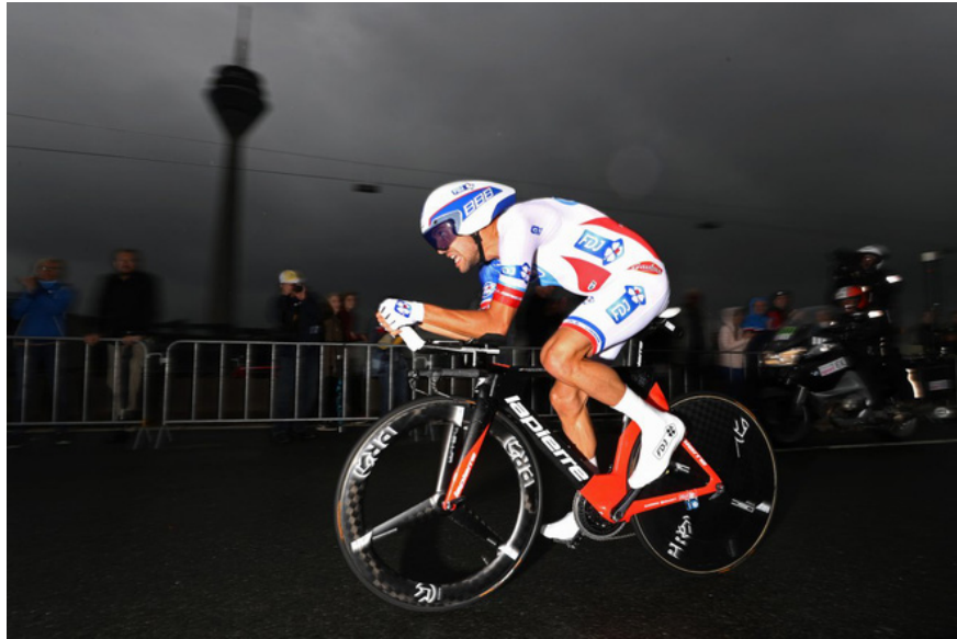
Racer Thibaut Pinot (FDJ) and the Lapierre Aerostorm DRS TT finish 60th.