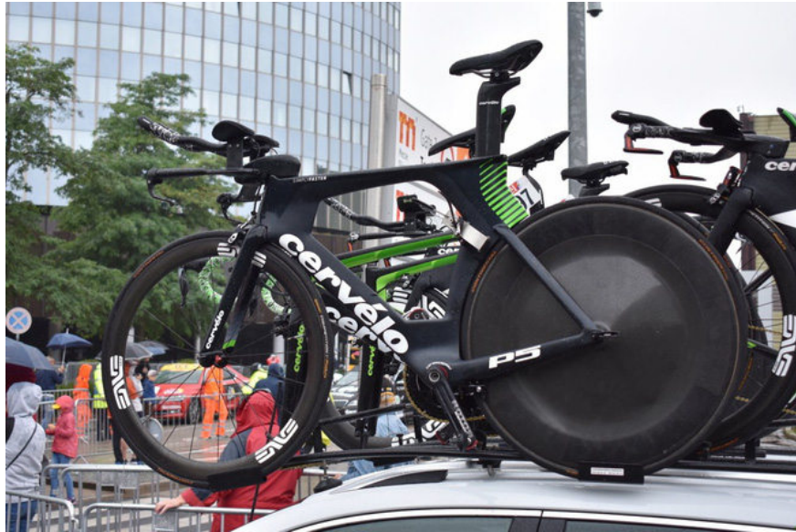
Dimension Data team brings the Cervélo P5s to the 2017 Tour de France.