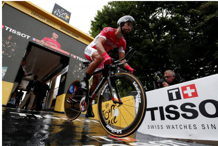
French athlete Nacer Bouhanni (Cofidis-Solutions Crédits) kicked the Orbea Ordu and returned to 193.