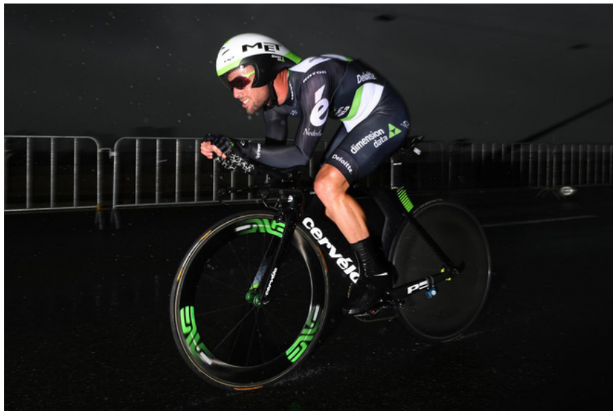
Racer Mark Cavendish (Dimension Data) and Cervélo P5. He rolled the finish at position 176