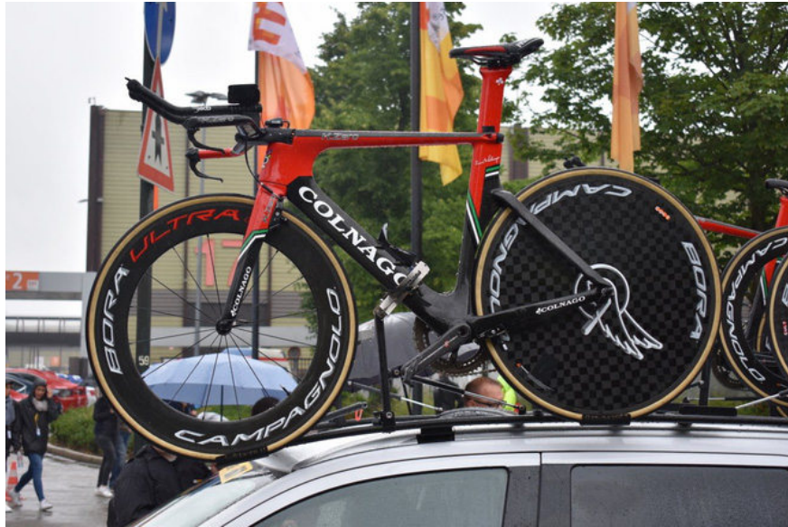
Emirates' Colnago K.One TT is from UAE.