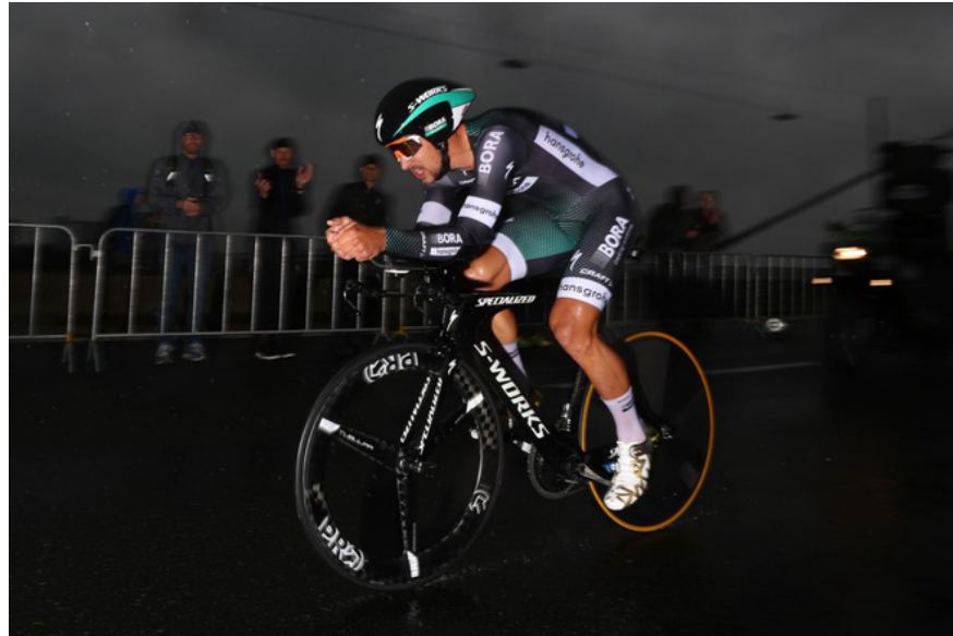
Specialized S-Works Shiv with Peter Sagan (BORA-Hansgrohe) driver.