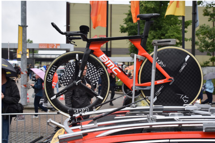
BMC Timemachines of BMC Racing team.