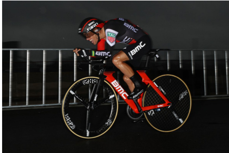
Australian athlete Richie Porte (BMC) and BMC Timemachine. This driver ranked 49th in the race.