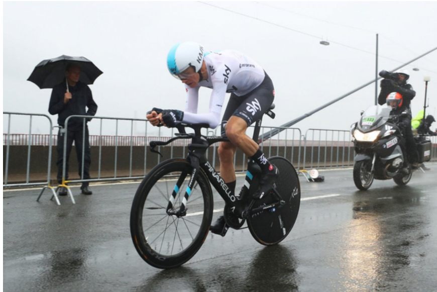
Defending champion Chris Froome (Sky) and Pinarello Bolide.