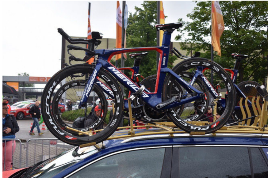
Bahrain-Merida team and Merida Warp TT bike.