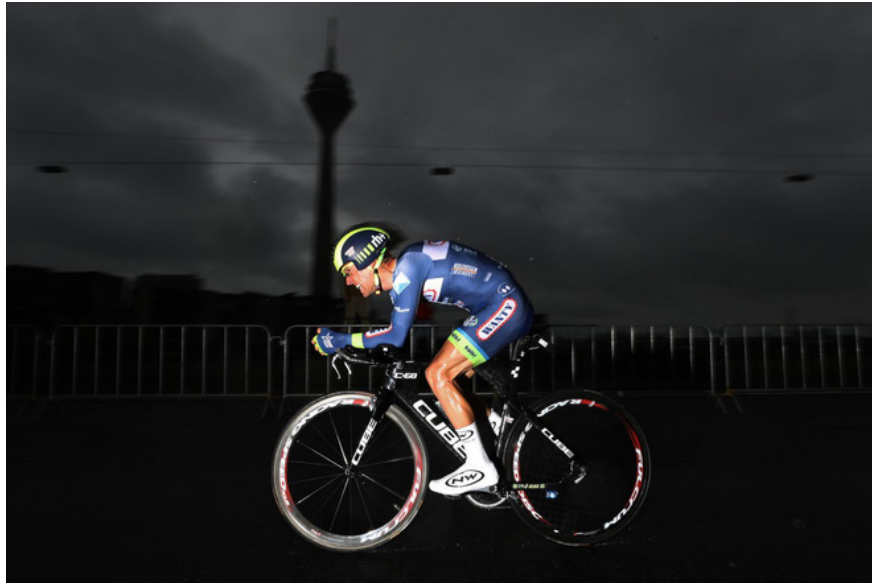
Cube Aerium C: 68 TT bike from Wanty-Groupe Gobert from Belgium.