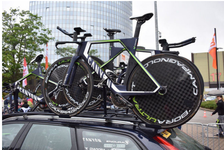
Movistar team with the Canyon Speedmax CF TT to join the race.