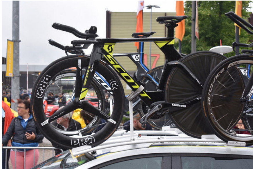
Orica-Scott's Scott Plasma TT.