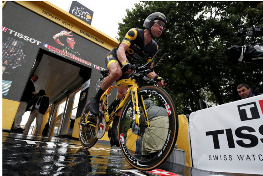
French driver Thomas Voeckler (Direct Energie) and BH Aerolight took the finish at 158th place.