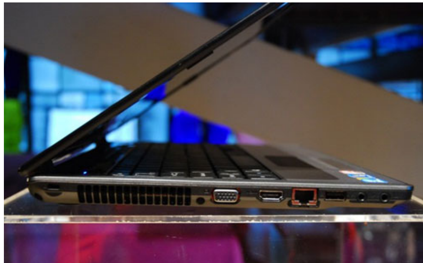
Next to the left with VGA, HDMI, LAN, USB and 2 headphone and microphone jacks.