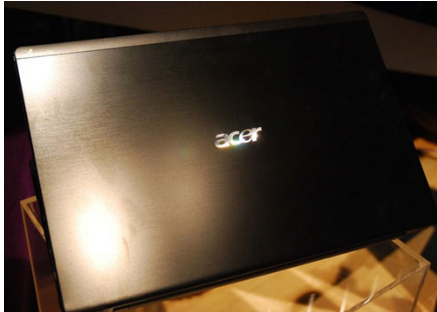
Top with glossy aluminum cover.