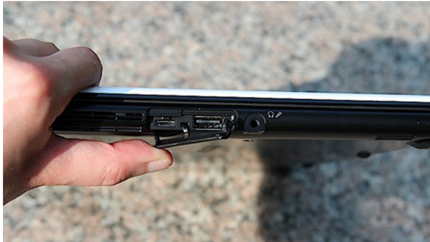
USB connection port.