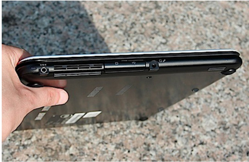
Side edge with radiator slot .