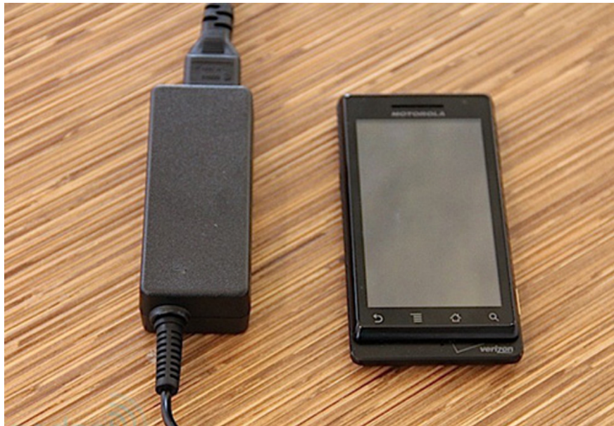
Charging the device is quite small.