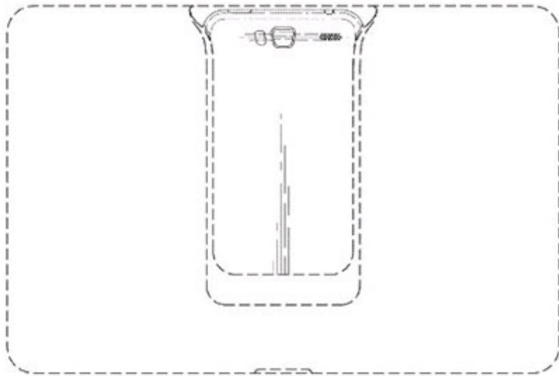
Phone paired tablets