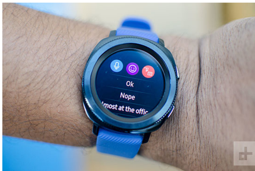
Ways to reply to messages on Gear Sport

In the event that Gear Sport connects to an Android phone, the notification system will work extremely efficiently. There are many ways to respond to emails and messages via Tizen: enter text from the screen, handwrite or reply by voice. The handwriting recognition mode works quite well and the watch has a text prediction feature that makes texting faster.