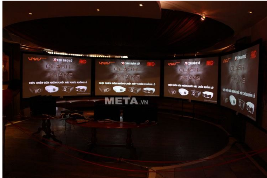
130-inch Digistorm curved projection screen